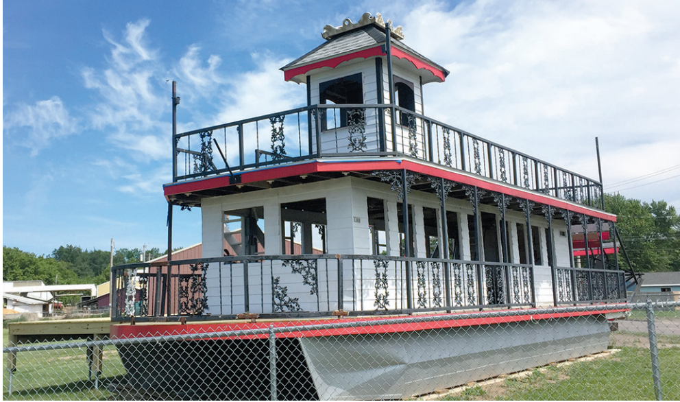
The Mississippi Showboat is restored to all its glory to welcome folks to the Aitkin County Fair. The fair is open for entries on Tuesday, July 3, and the midway is open on July 4. The fair continues through July 5-7. Highlights include bus and baja races, a patriotic display and pickle contest.