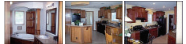
Forest River Housing – Model #156 with optional porch. 3BR, 2B home

Work with our knowledgeable sales staff to assist you in selecting the home that fits your needs & lifestyle.