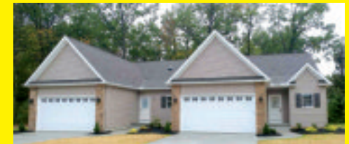
Breezewood Lane Condos Vermilion Call for details