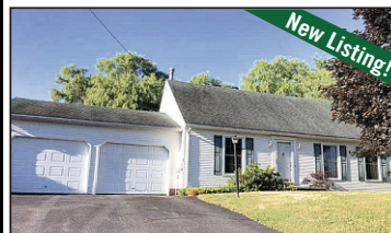
Oneida $164,900 Adorable well maintained Cape Cod. 3 spacious BRs, 2BAs, 2 car attached garage, nice yard and many updates.