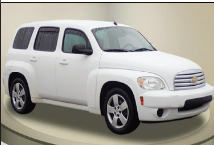
2011 Chevrolet HHR LS