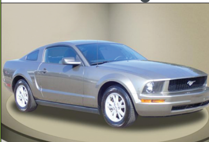
2005 Ford Mustang