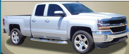
2016 Chevrolet Silverado 1500 Double Cab LT