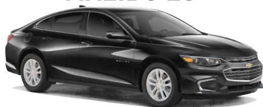
2018 MALIBU LS

24 MONTH LEASE $1,695 TOTAL DUE NOT ANOTHER PENNY