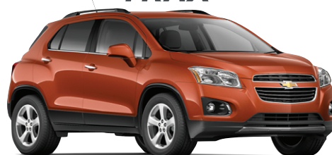
2018 LS TRAX