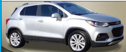
2018 Chevrolet Trax Premier