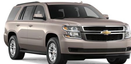
2018 TAHOE LS