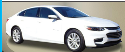
2016 Chevrolet Malibu 1LT