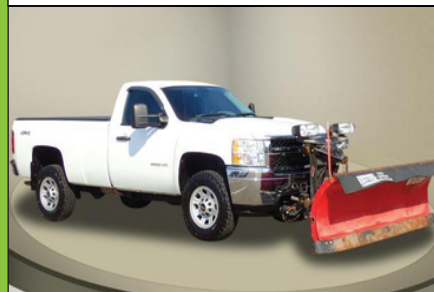
2012 Chevrolet Silverado 2500HD Plow Truck