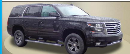
2015 Chevrolet Tahoe LT