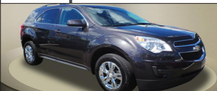
2015 Chevrolet Equinox 1LT