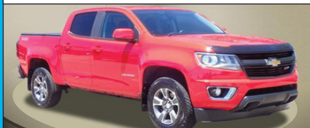
2016 Chevrolet Colorado Z71