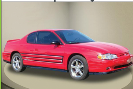
2004 Chevrolet Monte Carlo SS Supercharged