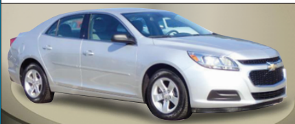
2015 Chevrolet Malibu 1LS