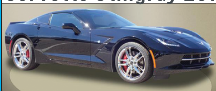
2015 Chevrolet Corvette Stingray Z51