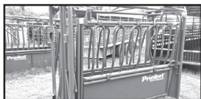
Priefert S04 Chute - $3,400