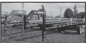
EZ Haul Hay Trailers 32' to 42'