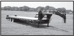
32' Flat Bed with Pop Up Dove Tail - $10,800