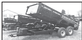
NEW Homesteader Dump 6' x 10', 7'x12', 7'x14'