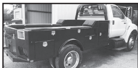
Norstar & Goosneck Truckbeds