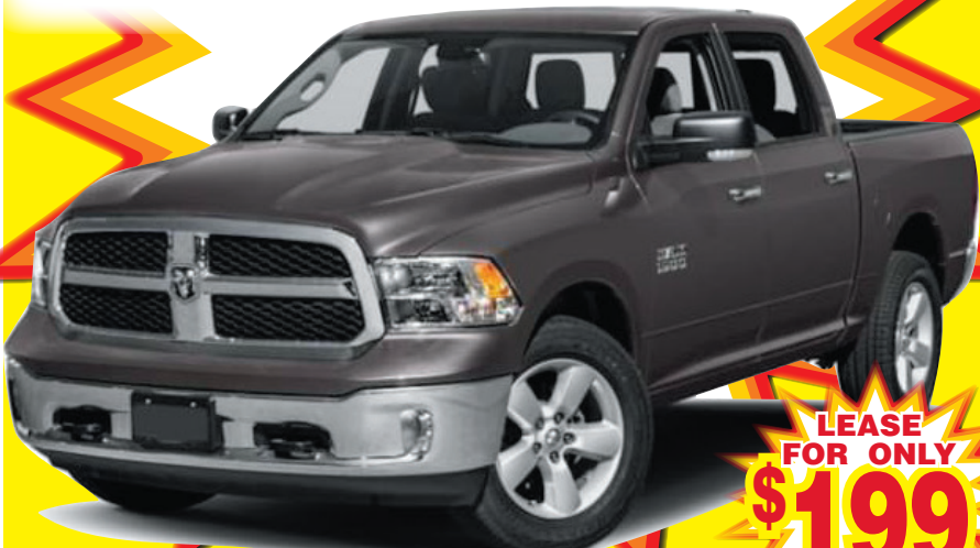
MSRP $48,925 Stock #18-0441

20 In Wheels, Heated Seat & Wheel, 8.4 U-Connect Screen and a Whole Lot More!!!