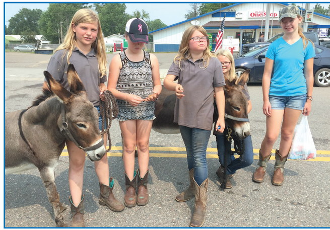
Members of the Young Riders 4-H Club walked donkeys in the parade.