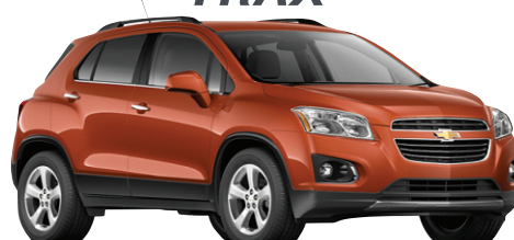
2018 LS TRAX