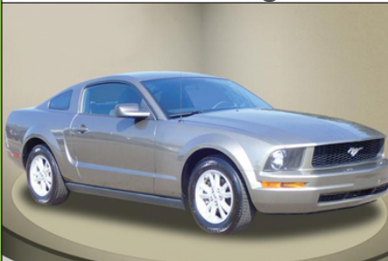
2005 Ford Mustang