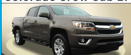
2015 Chevrolet Colorado Crew Cab LT