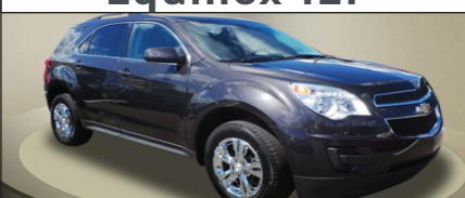
2015 Chevrolet Equinox 1LT