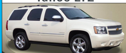
2013 Chevrolet Tahoe LTZ