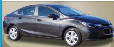
2017 Chevrolet Cruze LT