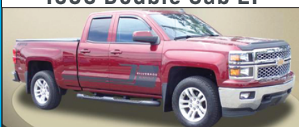
2015 Chevrolet Silverado 1500 Double Cab LT