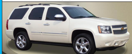
2013 Chevrolet Tahoe LTZ