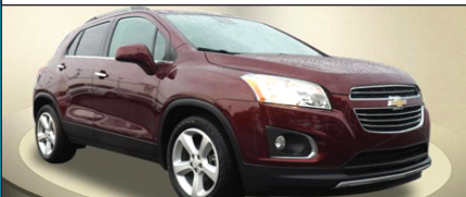
2016 Chevrolet Trax LTZ