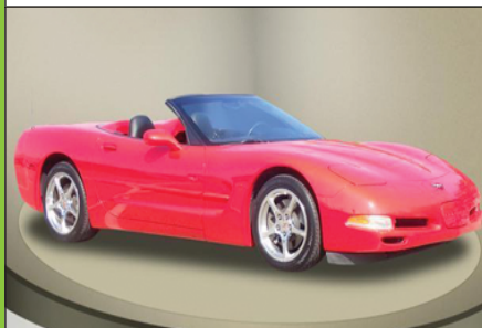
2002 Chevrolet Corvette Convertible