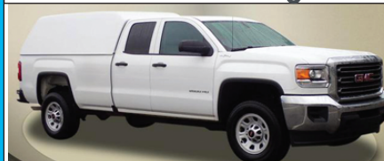
2016 GMC Sierra 2500 Double Cab Long Box