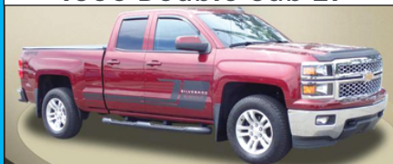
2015 Chevrolet Silverado 1500 Double Cab LT