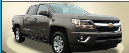
2015 Chevrolet Colorado Crew Cab LT