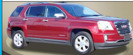
2017 GMC Terrain SLT