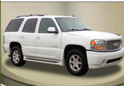
2006 GMC Yukon Denali