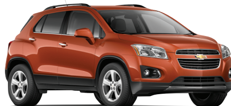
2018 LS TRAX