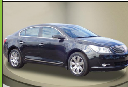
2013 Buick Lacrosse AWD Premium 1