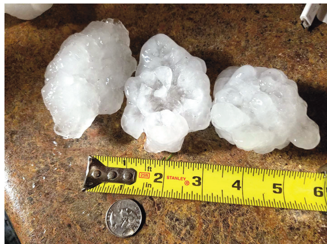
Hail in Aitkin compared to a quarter.

There was damage to vehicles at Brandl Motors dealership and many contractors were going door to door hoping to get work from storm victims.