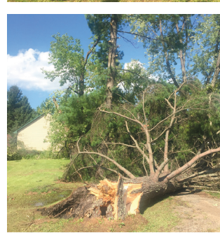
Trees were downed in Palisade, near tents and campers in Berglund Park and in yards across the road from the park.