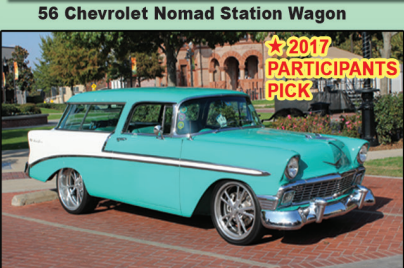
56 Chevrolet Nomad Station Wagon