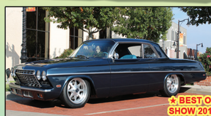
62 Chevrolet Impala