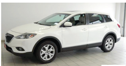
2013 MAZDA CX-9 GRAND TOURING

NAVIGATION, LEATHER HEATED SEATS, MOONROOF, ALL WHEEL DRIVE, 1 OWNER LAKE COUNTRY'S LOW PRICE $15,998