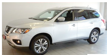
2018 NISSAN PATHFINDER SV

4X4, BACKUP CAMERA, POWER DRIVERS SEAT, BLUETOOTH, STEERING WHEEL, AUDIO CONTROLS, ALLOY WHEELS, AUX INPUT LAKE COUNTRY'S LOW PRICE $25,998