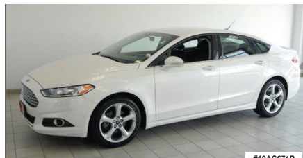
2015 FORD FUSION SE

POWER DRIVERS SEAT, STEERING WHEEL, AUDIO CON- TROLS, ALLOY WHEELS, 1 OWNER, GREAT FUEL ECONOMY LAKE COUNTRY'S LOW PRICE $13,998