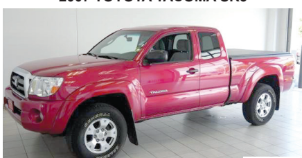
2007 TOYOTA TACOMA SR5

V6, 4X4, AUTOMATIC, 1 OWNER, ONLY 65K MILES, ABSOLUTELY IMMACULATE CONDITION LAKE COUNTRY'S LOW PRICE $18,998