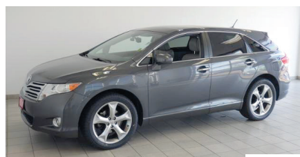
2012 TOYOTA VENZA LIMITED

ALL WHEEL DRIVE, V6, LEATHER HEATED SEATS, PANORAMIC MOONROOF, NAVIGATION LAKE COUNTRY'S LOW PRICE $16,998