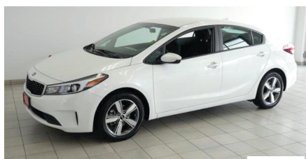
2018 KIA FORTE LX

USB INPUT, AUX INPUT, BLUETOOTH, BACKUP CAMERA, AUTOMAT- IC, FULL POWER EQUIPMENT, ONLY 12K MILES LAKE COUNTRY'S LOW PRICE $14,998