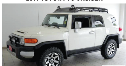
2011 TOYOTA FJ CRUISER

SUPER CLEAN, LOADED WITH OPTIONS!!! LAKE COUNTRY'S LOW PRICE $22,998