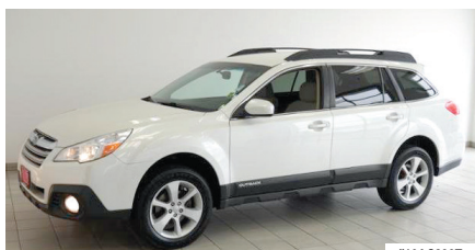
2014 SUBARU OUTBACK

2.5I PREMIUM, ALL WHEEL DRIVE, HEATED SEATS, ALLOY WHEELS, 1 OWNER LAKE COUNTRY'S LOW PRICE $13,998