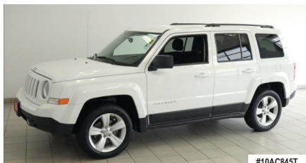
2015 JEEP PATRIOT LATITUDE

FACTORY REMOTE START, HEATED SEATS, AUTOMATIC, ALLOY WHEEL LAKE COUNTRY'S LOW PRICE $11,998