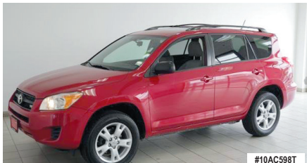
2011 TOYOTA RAV4

AWD, V6, 1 OWNER! LAKE COUNTRY'S LOW PRICE $8,498