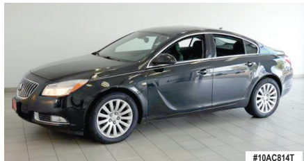
2011 BUICK REGAL CXL

LEATHER HEATED SEATS, MOONROOF, POWER DRIVERS SEAT, AUX INPUT LAKE COUNTRY'S LOW PRICE $7,987