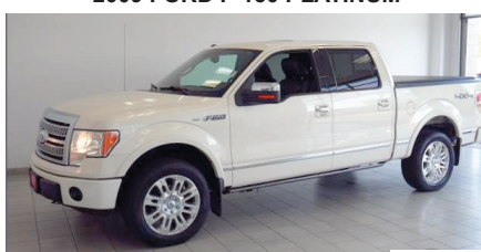
2009 FORD F-150 PLATINUM

SUPERCREW, NAVIGATION, LEATHER HEATED SEATS, 20 INCH WHEELS, TOW PACKAGE, BACKUP SENSORS, ONLY 102K MILES LAKE COUNTRY'S LOW PRICE $19,498