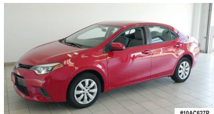
2016 TOYOTA COROLLA LE

BACKUP CAMERA, AUTOMATIC CLIMATE CONTROL, AUX IN- PUT 1 OWNER, OFF LEASE, BOUGHT AND SERVICED HERE LAKE COUNTRY'S LOW PRICE $12,998