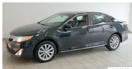
2012 TOYOTA CAMRY XLE

NAVIGATION, MOONROOF, LEATHER HEATED SEATS, POWER DRIVERS SEAT, ONLY 67K MILES LAKE COUNTRY'S LOW PRICE $13,998