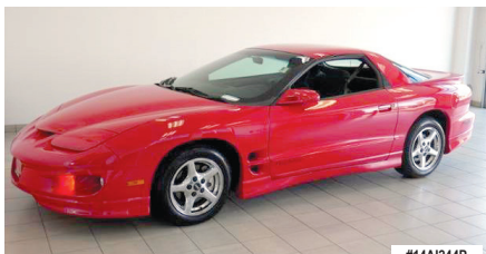
2002 PONTIAC FIREBIRD

ONLY 5,000 MILES, 1 OWNER, ONE OF A KIND, CHROME WHEELS, SHOWFLOOR CLEAN LAKE COUNTRY'S LOW PRICE $13,998