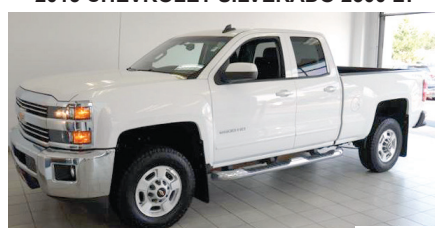
2015 CHEVROLET SILVERADO 2500 LT

DOUBLE CAB, BACKUP CAMERA, AUTO CLIMATE CONTROL, FACTORY TRAILER BRAKE, POWER DRIVERS SEAT LAKE COUNTRY'S LOW PRICE $28,998