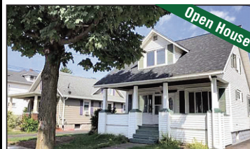
Oneida $154,900 Surprising space, 3-4 BR, hardwoods, original woodwork, nice open layout with many new updates. 9/23 OPEN SUN 10-12 • 318 Earl Ave