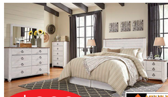
Ashley 4-Piece Two Tone Bedroom Suite