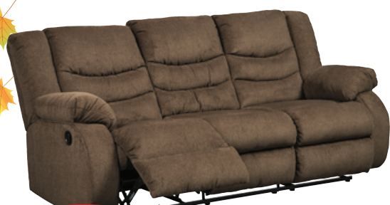
Ashley Tulen Reclining Sofa