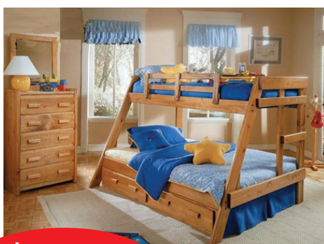
Wood Twin/Full Bunkbed