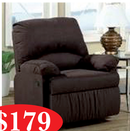
Wallaway Chaise Recliner