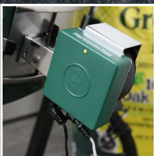
Big Green Egg Genius

CHOOSE $100 OFF ALL FULL-SIZED GRILLS - OR - $200 IN FREE ACCESSORIES!