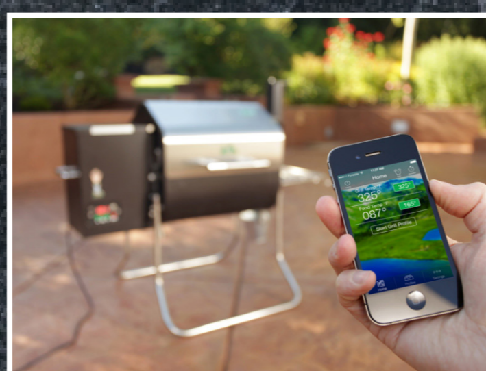
GMG WiFi Controller