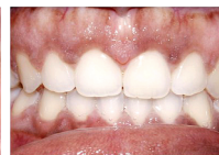
Digital impression with iTero® technology