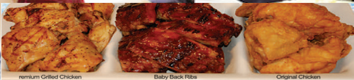
remur Grilled Chicken