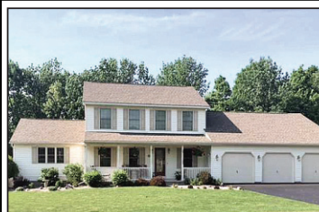
Oneida $299,900 Unbelievable Colonial, 5BR, 2.5BA, 4 car garage, large cherry kitchen, granite countertops, hardwood floors and more.