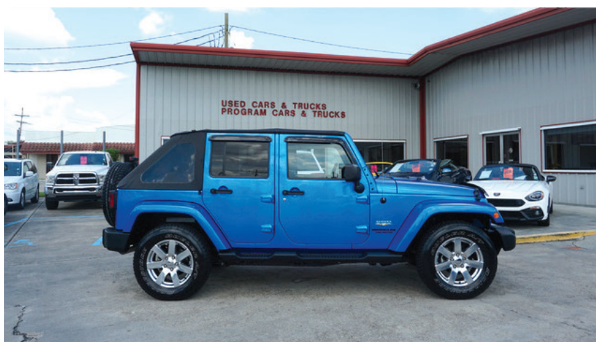
15 Jeep Wrangler Unlimited Sahara #8T0500A..... $31,997