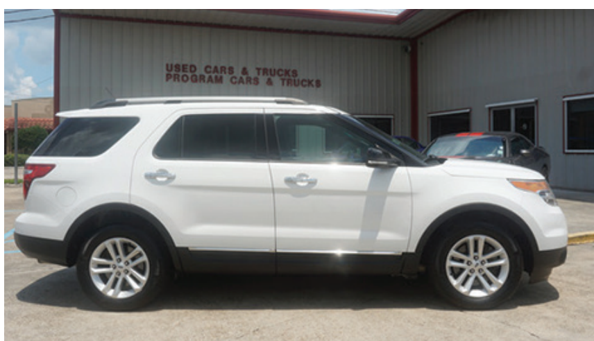
13 Ford Explorer XLT #9J0012A..... $16,997