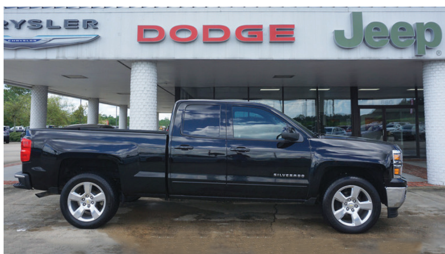
15 Chevrolet Silverado 1500 LT #T8J031A..... $23,497