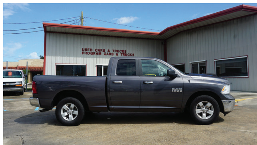
17 Ram 1500 SLT #10951..... $23,997