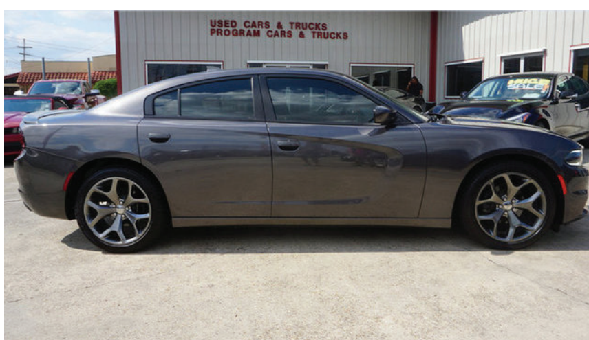
18 Dodge Charger SXT #10767..... $23,500