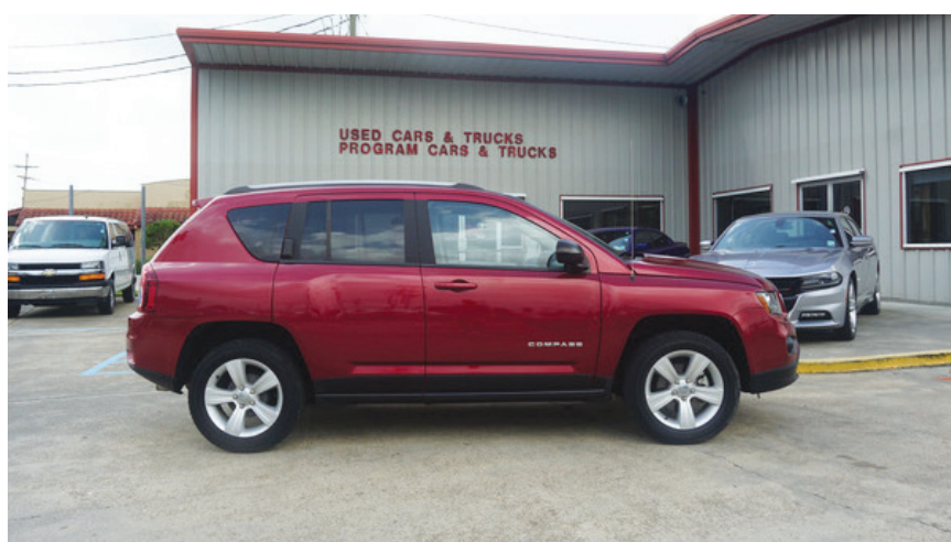
15 Jeep Compass Sport #10937..... $14,997