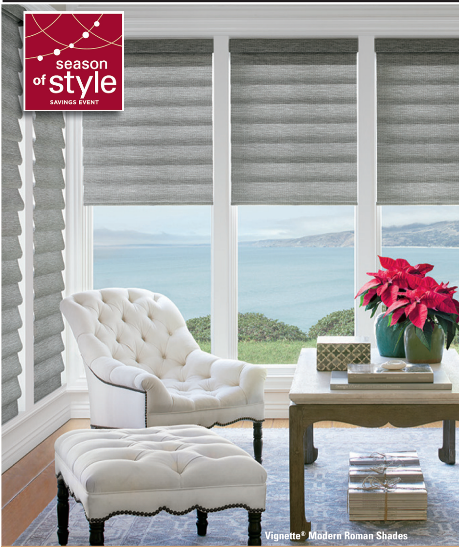
Vignette® Modern Roman Shades

Get ready for holiday gatherings with stylish new shades and save.