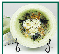
SCENTED WAX VESSELS