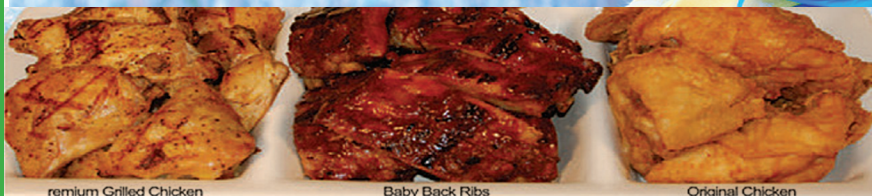
remium Grilled Chicken