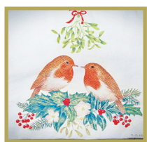
FLOUR SACK TOWELS