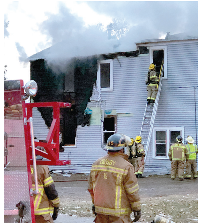
A fire burned in a two-story fourplex located at 2nd Avenue and 1st Street NW in Crosby on Friday, Nov. 16. The Crosby Fire Department responded and called both the Deerwood and Brainerd fire departments to assist in battling the blaze.