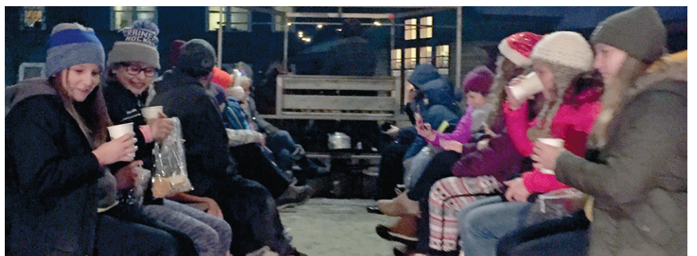
Horse-drawn wagon rides delighted riders during the Cuyuna Christmas celebration at Heartwood Senior Living in Crosby.