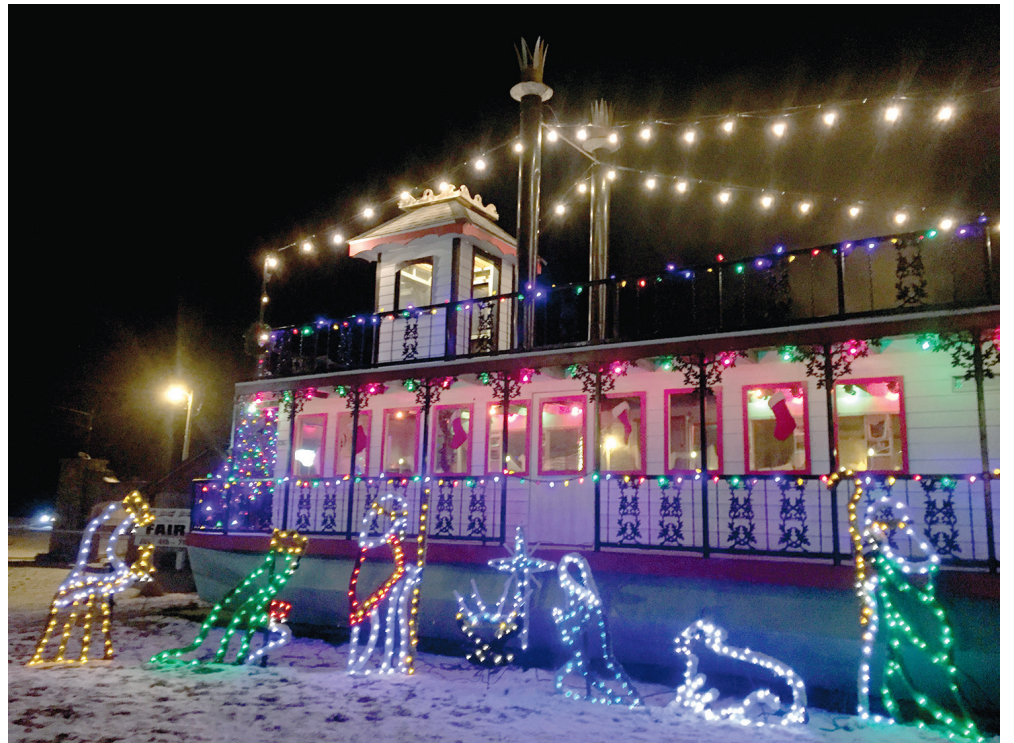
Aitkin's Mississippi Showboat is refurbished and aglow with lights and decorations.

Be sure to drive by the showboat on Minnesota Avenue North in Aitkin at the entrance of the fairgrounds to see the new lights.