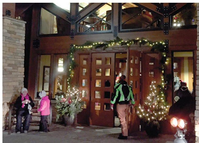
Formerly known as Christmas in the Park, Cuyuna Christmas was moved to Heartwood Senior Living in Crosby.