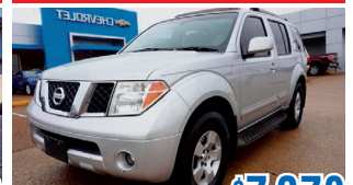
2005 Nissan Pathfinder SE