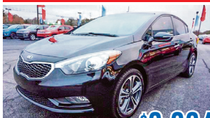
2014 Kia Forte EX