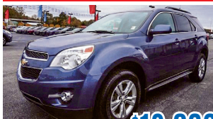
2013 Chevrolet Equinox LT