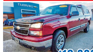
2006 Chevy Silverado LS