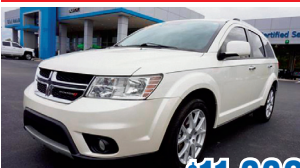
2013 Dodge Journey Crew