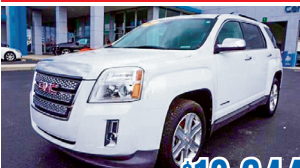
2011 GMC Terrain SLT-2