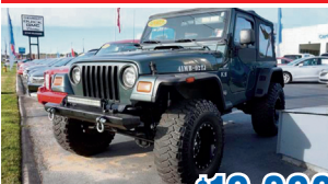
2002 Jeep Wrangler X