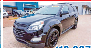
2017 Chevy Equinox LT