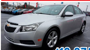
2014 Chevrolet Cruze 2LT