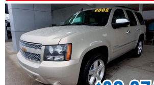
2009 Chevy Tahoe LTZ