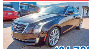
2015 Cadillac ATS