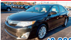
2012 Toyota Camry Hybrid XLE