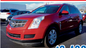
2011 Cadillac SRX Luxury