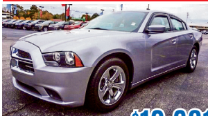
2014 Dodge Charger SE