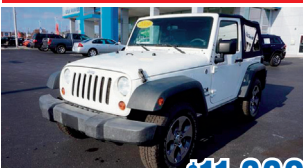
2009 Jeep Wrangler X