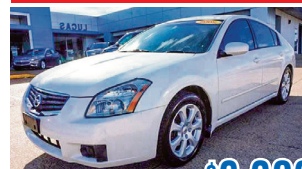
2008 Nissan Maxima 3.5 SL