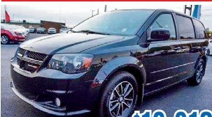
2014 Dodge Grand Caravan SXT