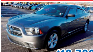
2011 Dodge Charger SE