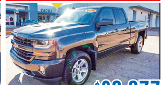
2016 Chevy Silverado 1500 Z71