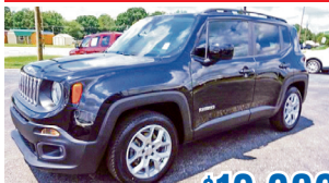
2015 Jeep Renegade Latitude