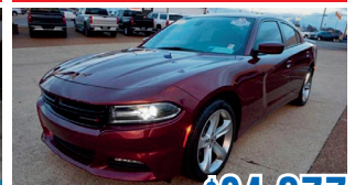
2017 Dodge Charger SXT