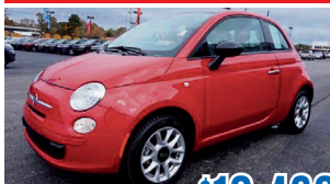
2017 Fiat 500 Pop