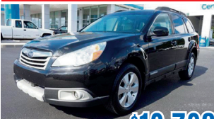
2011 Subaru Outback 3.6R Limited