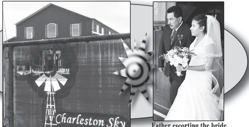
Father escorting the bride.