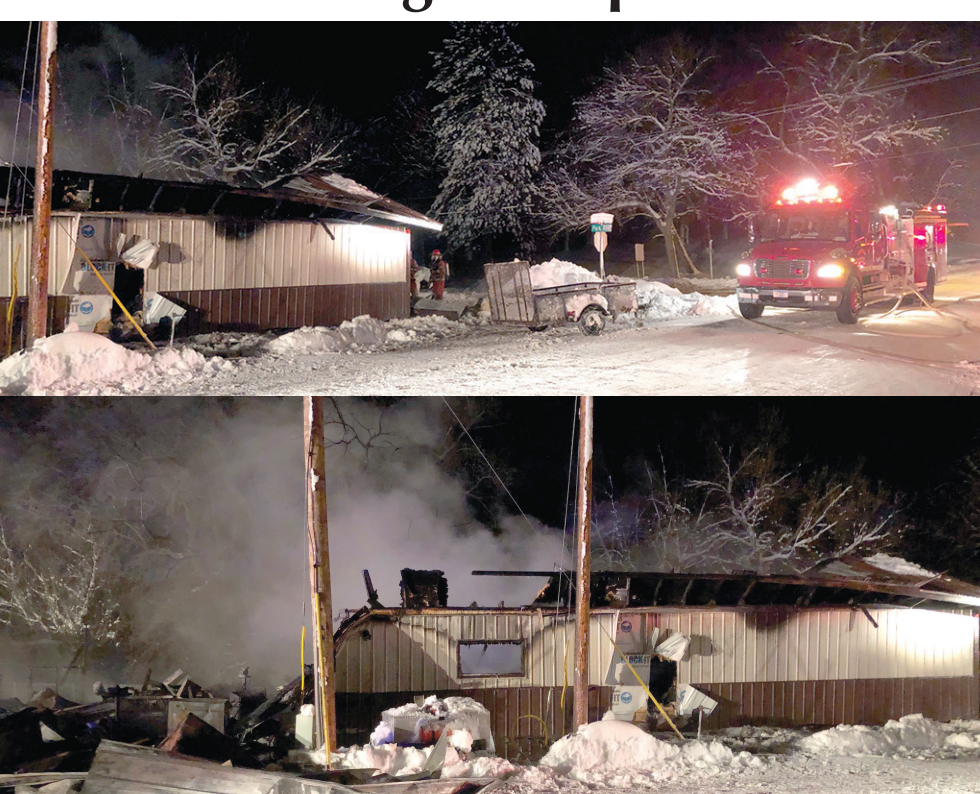
The Crosby Fire Department, along with Ironton and Deerwood Fire Departments, responded to a fire at Bud's Small Engine Repair Shop at 20233 Hematite Street in Irondale Township on Friday, Dec. 28.