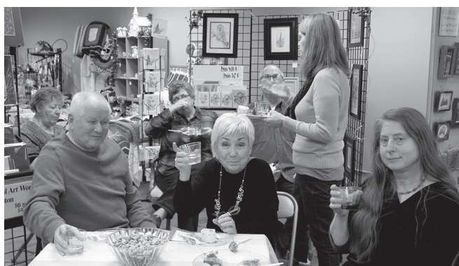
Artisan guild members celebrate their first year in the retail store at 214 Minnesota Avenue North in Aitkin.

now houses artistic displays by area artists and craftsman.