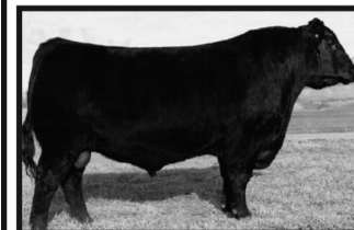
Musgrave Big Sky