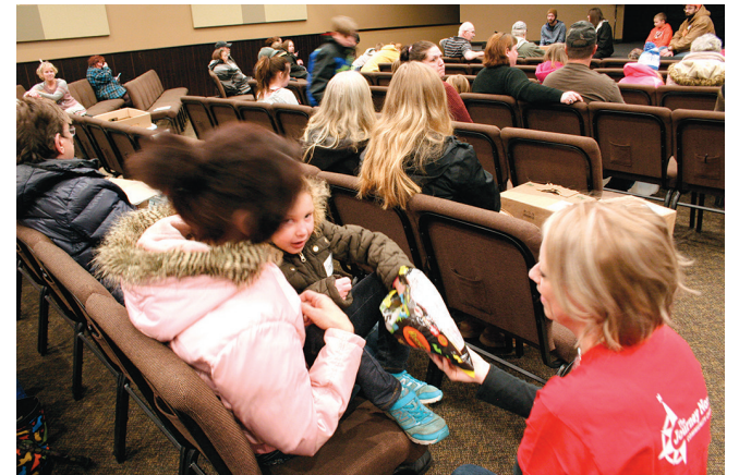
A volunteer gives children pieces of candy while they wait.

It was indeed a social gathering as friends greeted on another in the foyer of the church, step one. After hand-