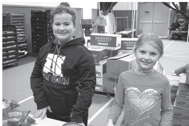
More helpers in the grocery room.

Ruby's Pantry will be in Aitkin, at the Journey North church, at 810 2nd St. NW in Aitkin, on the first Saturday of each month from 9 to 10:30. Be sure to bring something to carry your groceries in and be prepared to stand for a while.