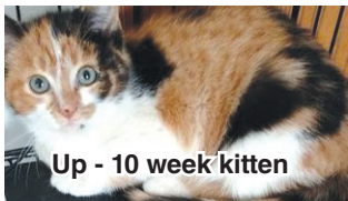
Up - 10 week kitten

But others have survived — and they thrive. If you can't take good care of your animals for whatever reason, or you want to adopt an animal, volunteer, or donate, call Scooby's Animal Mission at 218-670-0319 or log onto Scoobysanimalmission.org.