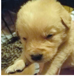
Although small now, these puppies will be BIG dogs (Mastiff /Bermese Mountain Dog mix.) These puppies will be ready for new homes around February 19 and will come spayed/neutered, with age appropriate shots, a puppy gift pack, vet records, and contract.