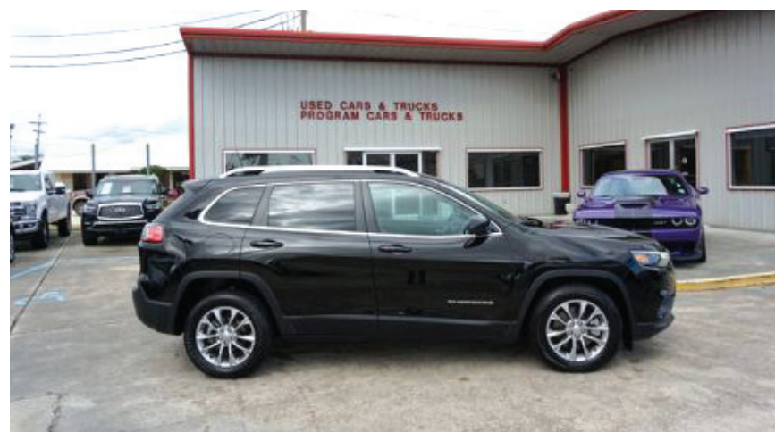
19 Jeep Cherokee Altitude #11022..... $21,497