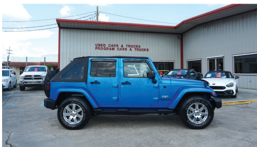
15 Jeep Wrangler Unlimited Sahara #8T0500A ..... $31,997