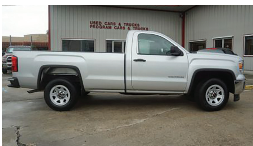
14 GMC Sierra 1500 #8T0414A ..... $12,997