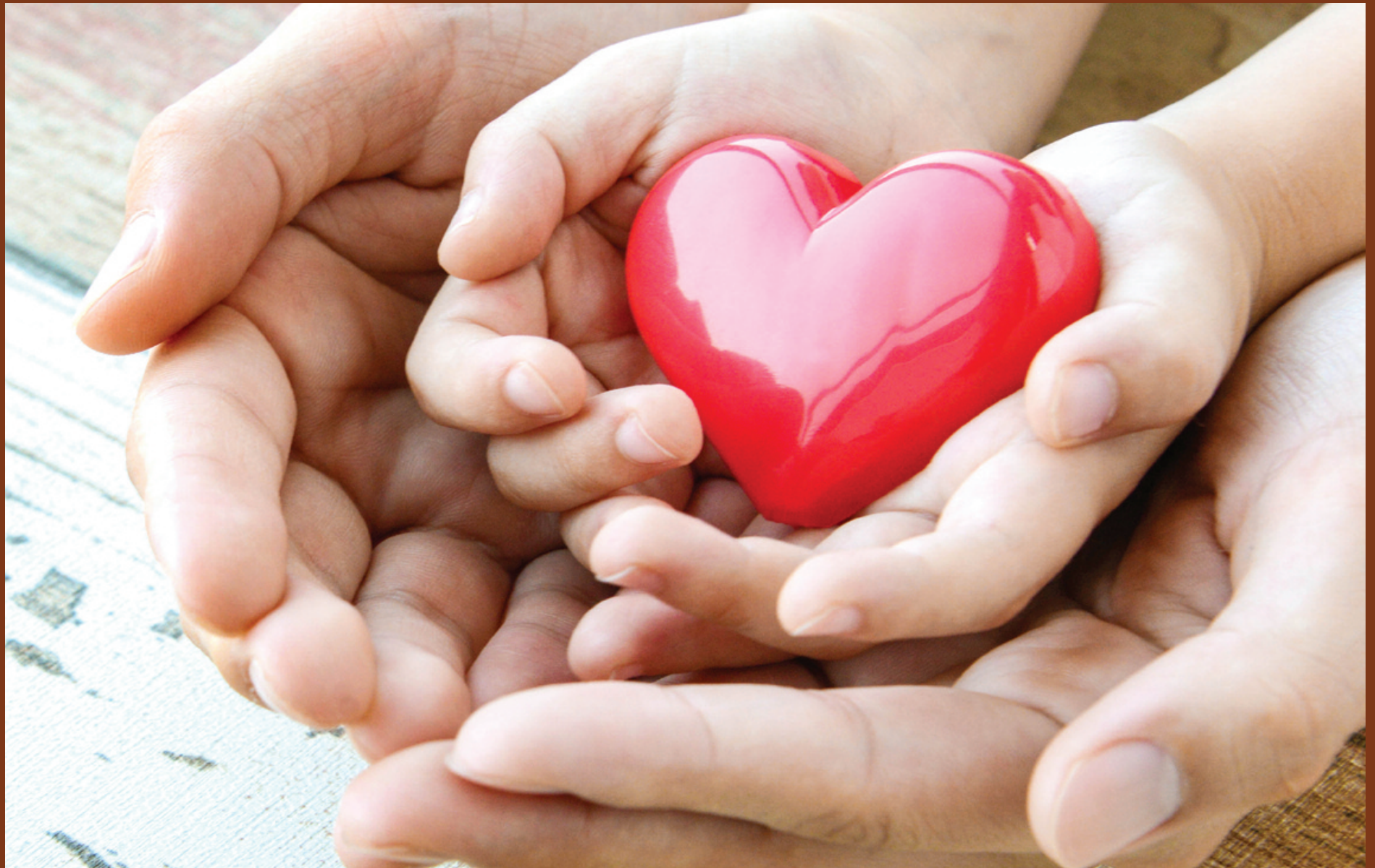
A Supplement To The East Penn Valley & Northern Berks Merchandisers February 6, 2019