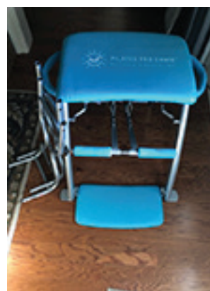
PILATES PRO CHAIR All instructional DVDs included. $90. 985-232-3817

MAUSOLEUM FOR TWO FOR SALE Terry one Memorial Park Corridor J, crypt 109, tier C. Asking $6,500 or best offer. Call 985-804-8687.