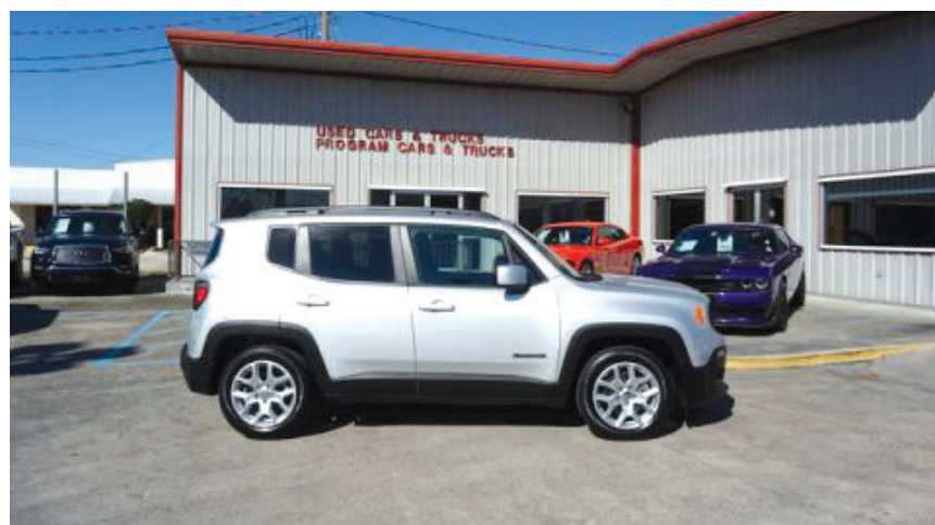
17 Jeep Renegade Altitude #8J0251A..... $16,997