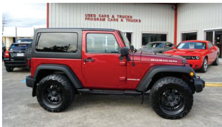
13 Jeep Wrangler Rubicon #10965B ..... $26,997