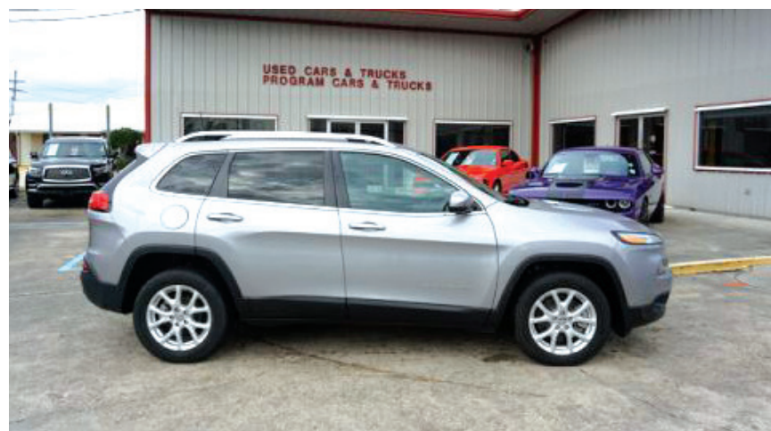
18 Jeep Cherokee Latitude #10886..... $21,900