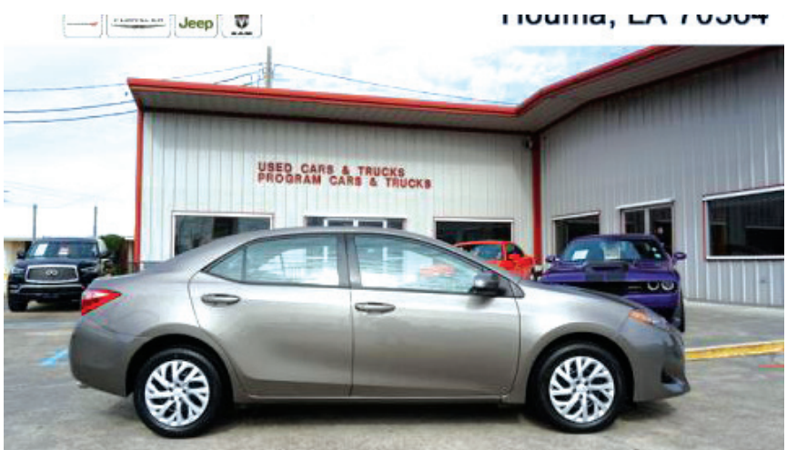
18 Toyota Corolla LE #11038..... $15,497