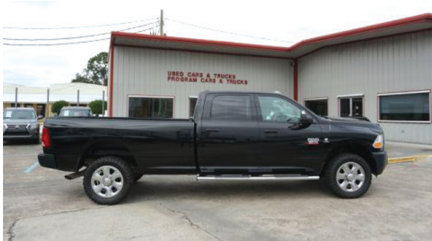
12 Ram 3500 ST #8T0385B..... $35,997