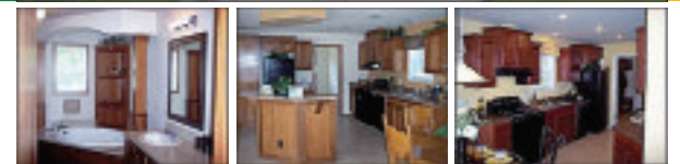
Forest River Housing – Model #156 with optional porch. 3BR, 2B home

Work with our knowledgeable sales staff to assist you in selecting the home that fits your needs & lifestyle.