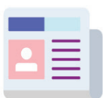
Local News Advertising

Adtaxi is a client-centric organization that brings scale, precision, and sophistication to digital marketing. Leveraging the belief that people matter as much as technology, we help automotive dealerships solve complex marketing challenges with custom, performance-driven solutions.