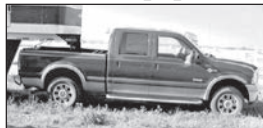
2005 F-250 King Ranch 189K miles