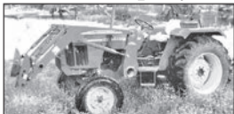
JD 5303, 2WD, w/loader; JD 512, 1224 hrs.