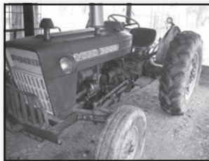
Two Auction Crews Running So Bring A Friend!!!

Terms: Cash or good check. Sale held rain or shine. Good Food Available.