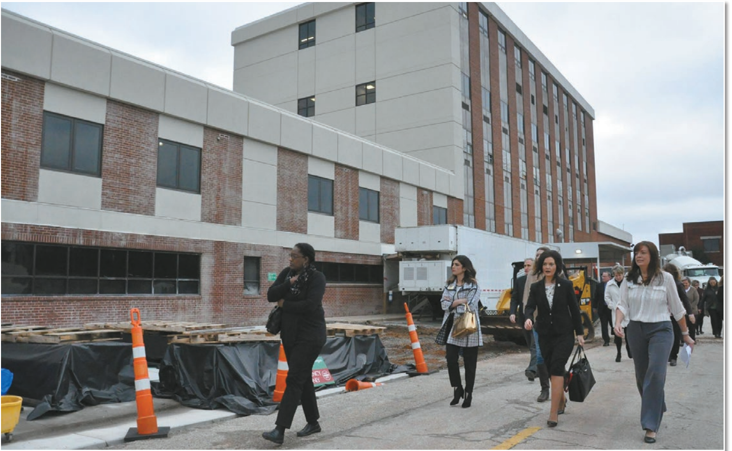
Renovations continue onsite at Decatur Morgan Hospital, including new exteriors and new entrances.