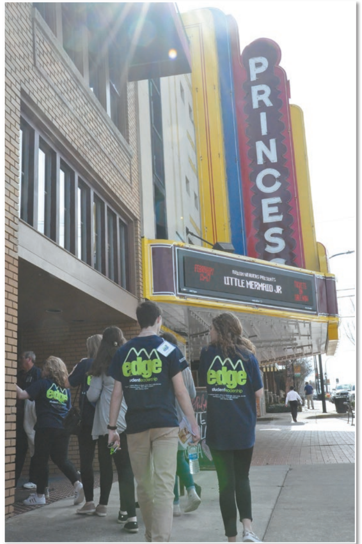
Students toured and had lunch at the Princess Theatre as part of the Edge session on our area's legacy.