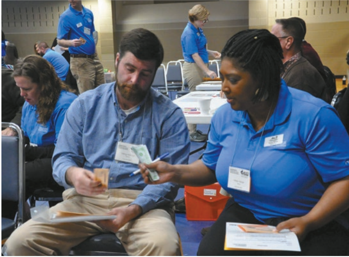
The Excellence in Leadership class participated in a poverty simulation as part of their January session.