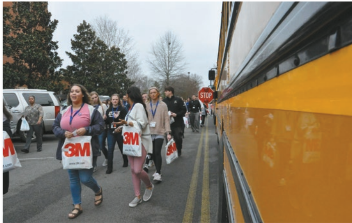
The Career & Workforce Expo is one of the largest events in our region for students to learn more about careers and courses of study to plan for their future.