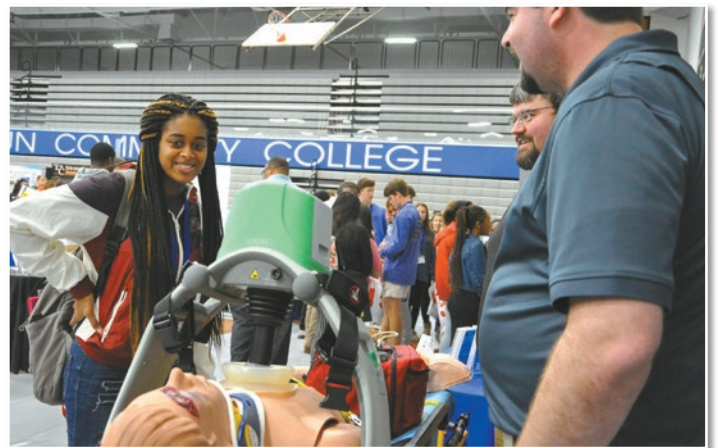
Exhibitors in fields like healthcare, utilities, finance, manufacturing, IT and other STEM fields took part in the Career & Workforce Expo.