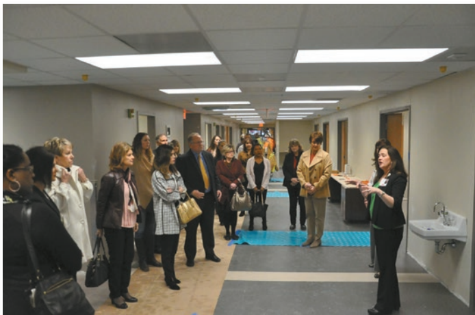
Attendees were able to tour the newly renovated facilities, including the newly designed Emergency Department.