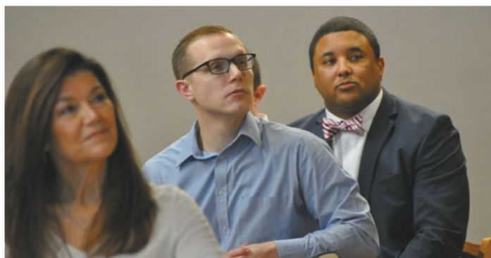
Attendees representing non-profits, professional services, real estate, media groups, financial services, healthcare and more took part in the Chamber’s Breakfast & Biz event focusing on networking.