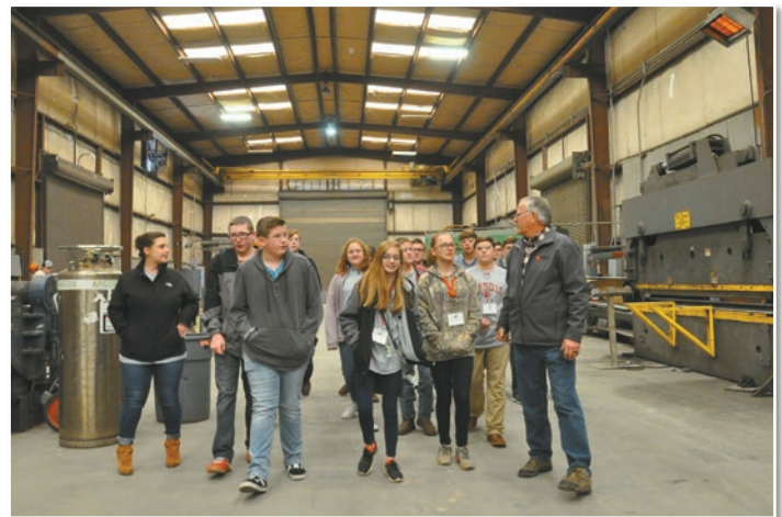
Equip students visited Hubbard & Drake Contractors to discuss careers in manufacturing and fabrication.