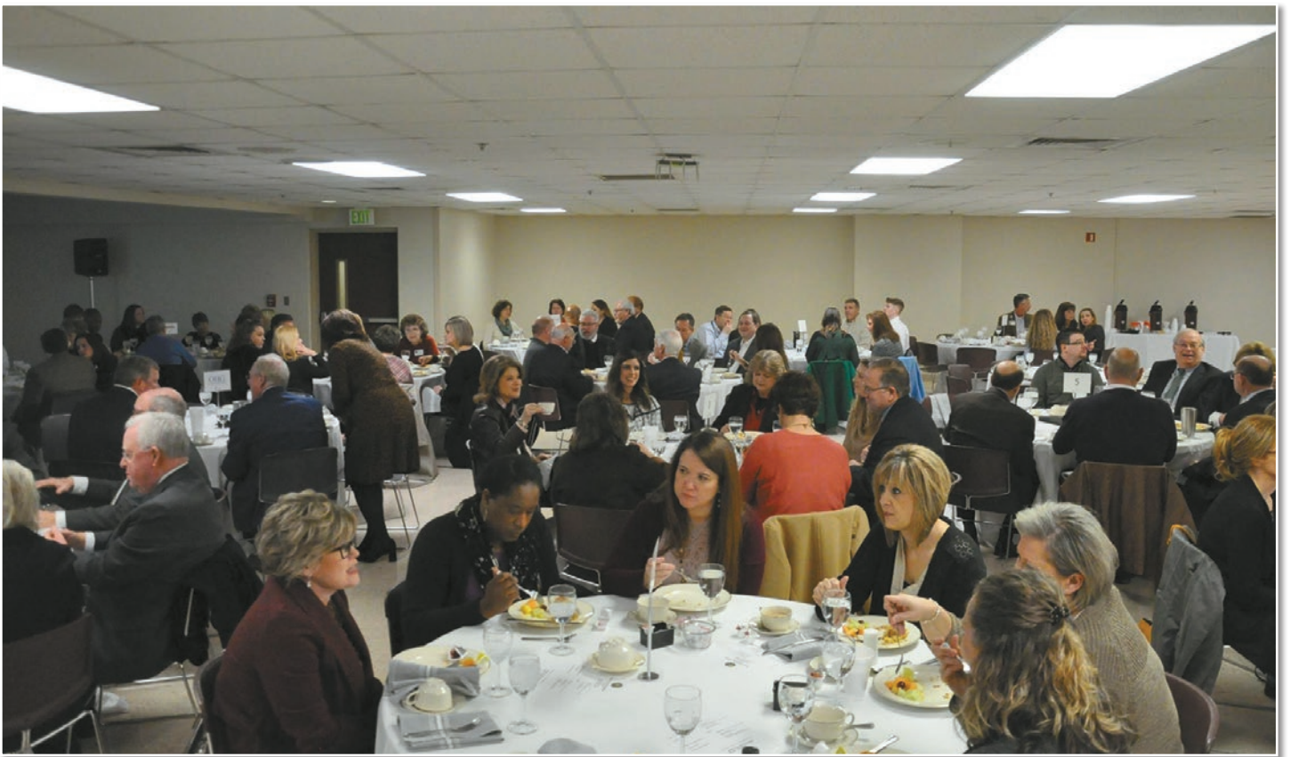
More than 125 people attended the State of Healthcare Address, held for the first time at Decatur Morgan Hospital.