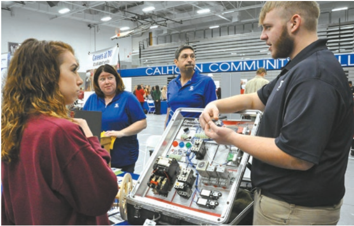
The Career & Workforce Expo is a chance for high school students to speak with professionals in areas where students have an interest about careers and opportunities for growth.