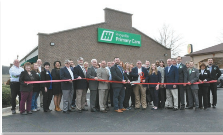
Priceville Primary Care 68 Marco Drive, Decatur • (256) 973-5650