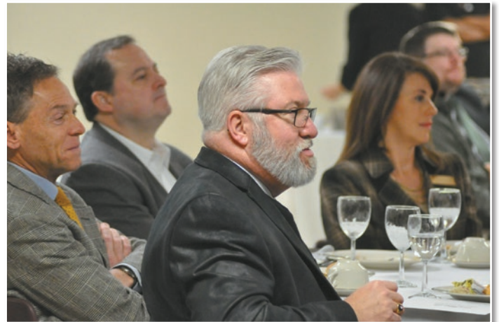
Community and business leaders from across Morgan County attended the State of Healthcare Address.