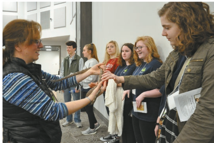
Edge students toured part of the soon-to-open Cook Museum of Natural Science as part of their day highlighting the city "now and then."