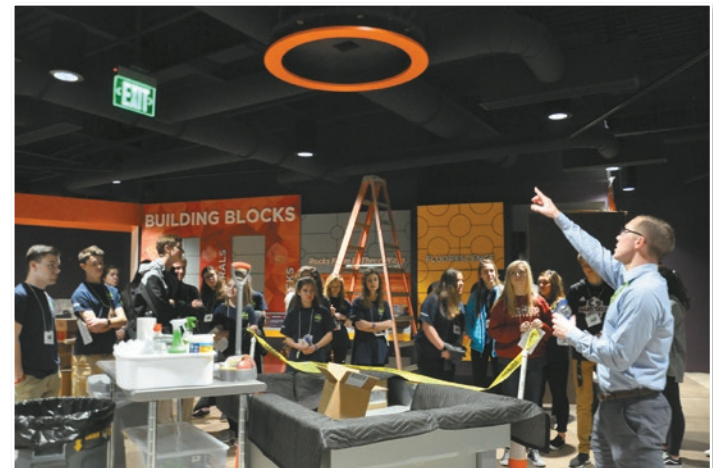
Members of the Edge class were treated to a behind-the-scenes tour of the Cook Museum as part of their day discussing the history and heritage of Morgan County.