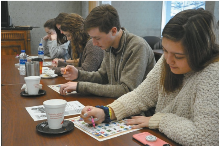
During the briefing with Nails, students played an economic development board game where their communities competed in the recruitment of industries and retail.