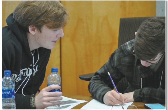
Equip students collaborated on several projects during the January class session, including an interview role-playing game called "Right Way, Wrong Way."