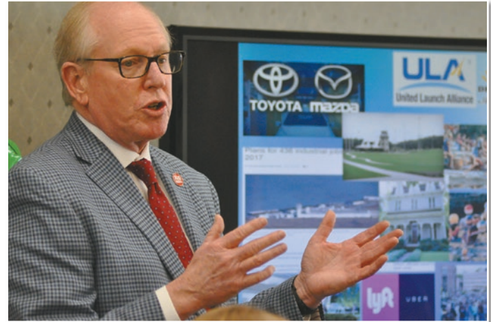
City of Decatur Mayor Tab Bowling discussed with Edge students his leadership style and how it developed over time.