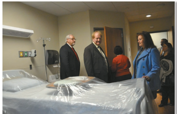
Tours of the updated hospital facilities were available to attendees, including new private rooms.