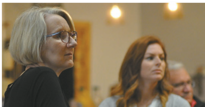
Community and business leaders from across our region attended the Chamber’s Breakfast & Biz event focusing on networking.