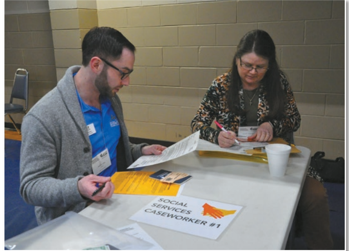
As part of the poverty simulation, Excellence class members were given scenarios involving decision-making on topics like healthcare, education, housing, and the corrections system.

The Chamber's three leadership programs – Excellence, Edge and Equip – each continued their focus on personal and professional development as the calendar flipped over to a new year.