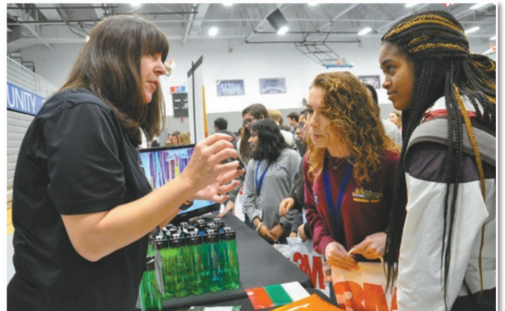
More than 30 business and industry partners took part in the Career & Workforce Expo.