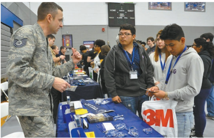
Students from Morgan, Limestone and Lawrence Counties took part in the annual Career & Workforce Expo.