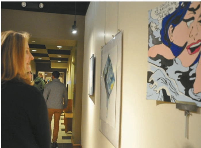
Excellence class members toured the Alabama Center for the Arts in downtown after having to reschedule from a previous class.