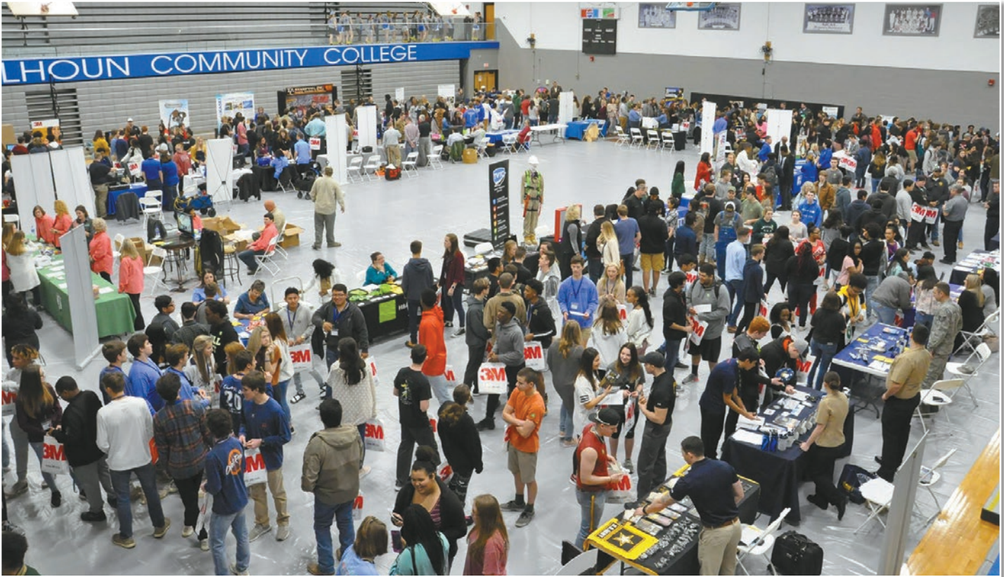
More than 1,500 students from area high schools attended the Career & Workforce Expo.