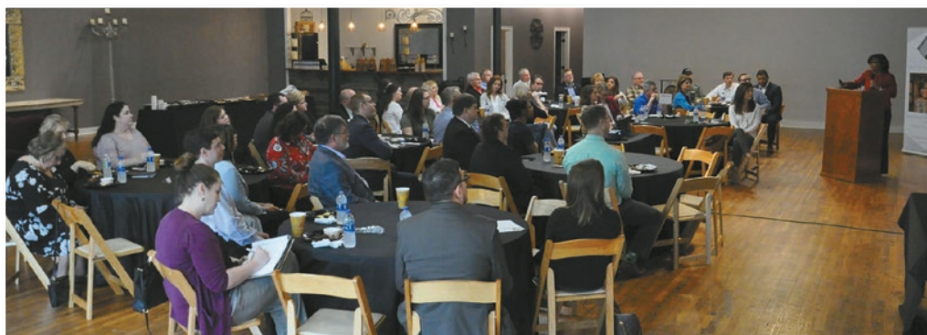
We are thankful for the hospitality of The Magnolia Room for serving as the venue sponsor for Breakfast & Biz.