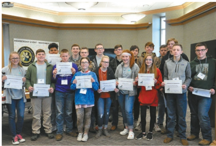
Session One of Equip ended the last day of January. A second session is set to kick off in February.