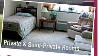
Private & Semi-Private Rooms