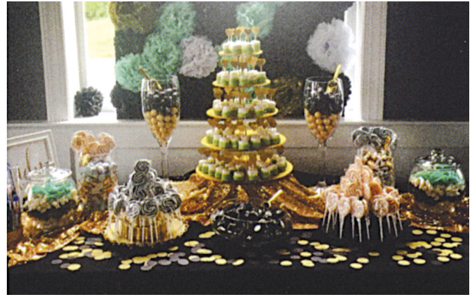
Photo Booths & Candy Tables