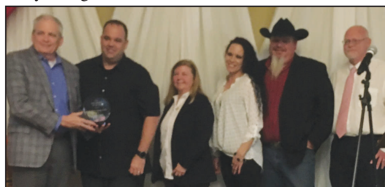
Small Business of the Year Hopkins County EMS