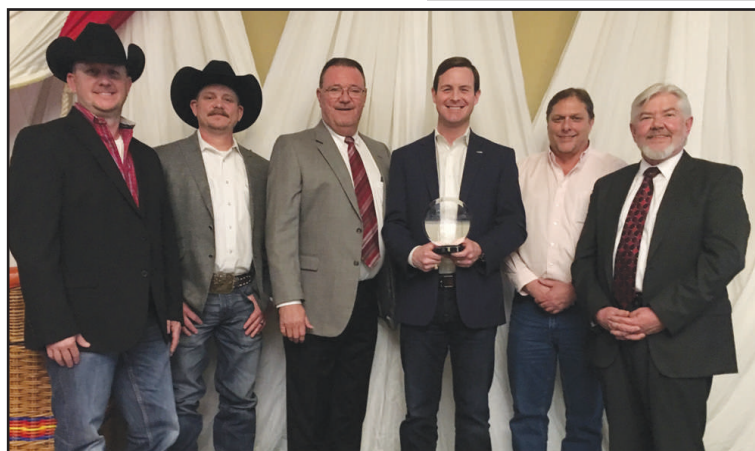
Large Business of the Year Jay Hodge Chevrolet