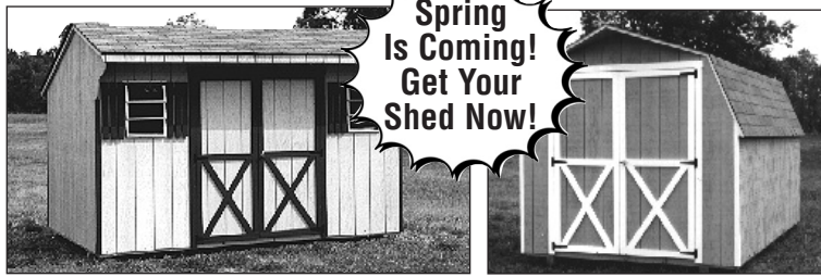
Quaker Shed Mini Barn We personally deliver all sheds and pass the savings to you!