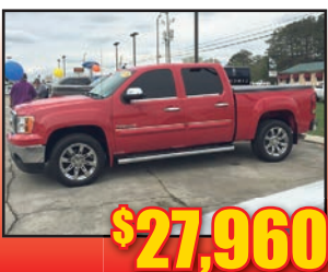
11 GMC Sierra SLE 32K Miles, Chrome Wheels, Eyecatcher, Stk#P4987