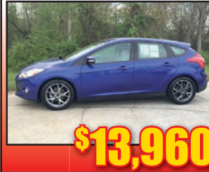
13 Ford Focus Auto, Hatch, Smoke Wheels, Gas Sipper, Stk#FF015A