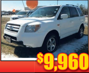
08 Honda Pilot EXL DVD, Leather, Very Nice, Stk#P4611B