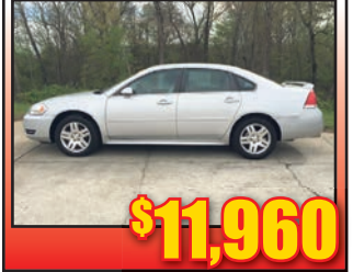
12 Chevy Impala Pwr. Seat, Spoiler, Low Miles, Stk#P4886A