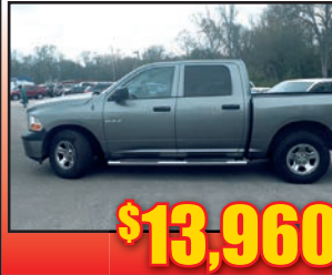
10 Ram 1500 Quad Cab, Good Running Truck, Stk#TF104B