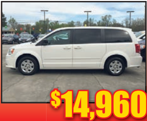
12 Dodge Grand Caravan SXT Stow N Go, Stk#4996