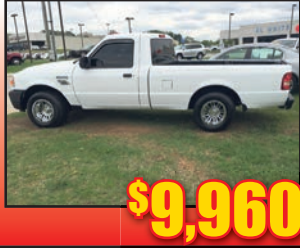
08 Ford Ranger Low Miles, Wheels, Auto, Stk#TF070M