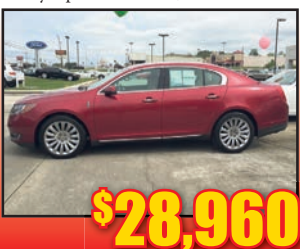
13 Lincoln MKS Candy Red, Every Option Available, Stk#P5005