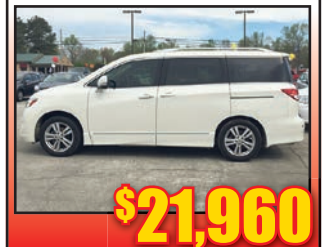
12 Nissan Quest SL Leather, Bucket Seats, Pwr Sliding Doors, Stk#P4968A