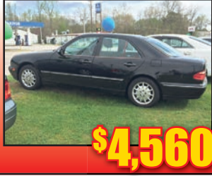
01 Mercedes E320 Great Shape, Roof, Leather, Stk#P5550