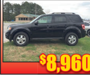
10 Ford Escape XLT Wheels, Power Sunroof, Stk#TF078A