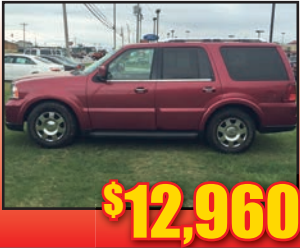
06 Lincoln Navigator Loaded, Very Clean, Local Trade, Stk#TF071N