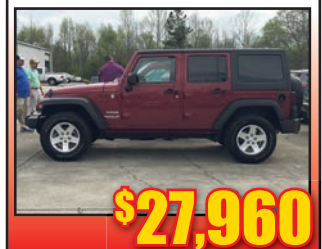
13 Jeep Wrangler 4DR, New Wheels & Tires, Nice, Stk#P4686A