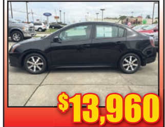
12 Nissan Sentra Nav., Spoiler, Sunroof, Bluetooth, Stk#P5010