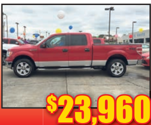
10 Ford F150 Supercrew, 4x4, Crew Cab, Look, Stk#P5006