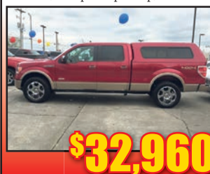
11 Ford F150 4x4 Lariat Sunroof, Camper Top Sharp, Stk#P5017