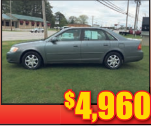
01 Toyota Avalon XLE Roof, Leather, Local, Stk#P4991A