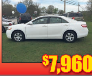
07 Toyota Camry Cruise, Power, Newer Tires, Stk#P4965A