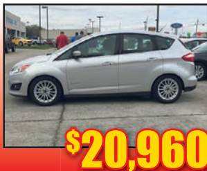
14 Ford CMax Leather, Nav., Loaded, 40 MPG, Stk#P4973