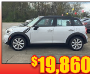
11 Mini Cooper Dual Roof, Racing Stripe, Auto Loaded, Stk#P4986