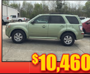
08 Mercury Mariner Low Miles, Local Trade, Sunroof, Stk#P4953A