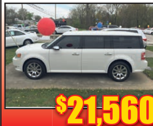
12 Ford Flex Leather, Limited, Nice 7 Pass. Seat, Stk#P4829A