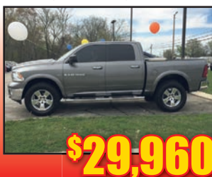
12 Dodge Ram 4x4, Lifted, 35" Tires, BBBBAAAD, Stk#TE214A