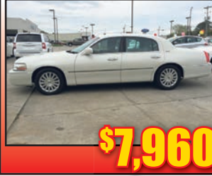
03 Lincoln Town Car Executive Luxury at its finest, Stk#P5009