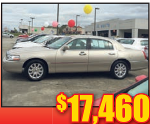
10 Lincoln Town Car Signature Edition, Low Miles, Stk#P5014