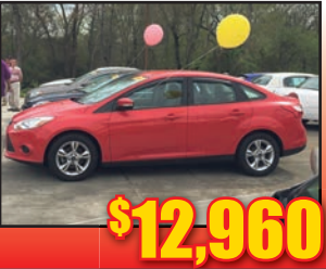
13 Ford Focus SE Auto, All Power, 35 MPG, Stk#P4914