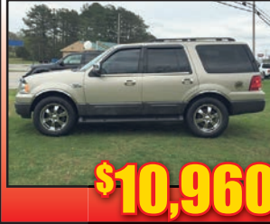
06 Ford Expedition 3rd Seat, 7 Passenger, Runs Great, Stk#FF014B