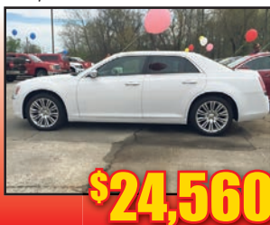
11 Chrysler 300 Dual Roof, Shiny Wheels, Breathtaker, Stk#P4982