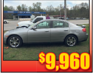
04 Infiniti G35 Leather, Roof, Stk#P4994