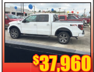
13 Ford F150 FX4 Super Crew, 4x4, Nav., Roof, Cooled Seats, Stk#TE216A