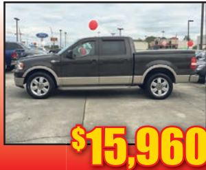
07 Ford F150 Super Crew, King Ranch, All The Buttons, Stk#TF071B