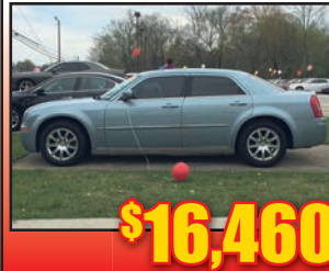
09 Chrysler 300 Roof, Leather, Chrome, Stk#P4983