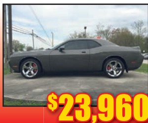
10 Dodge Challenger RT Leather, Roof, Hemi, Stk#P4624B