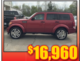
11 Dodge Nitro 4x4, RT, Chrome, 20" Wheels, Sharp, Stk#P4984