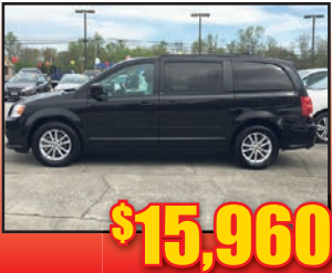
13 Dodge Caravan SXT Stow N Go, Vacation Ready, Stk#P5018