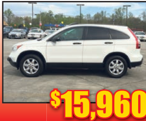
09 Honda CRV Sporty, Sunroof, Great Value, Stk#P5000