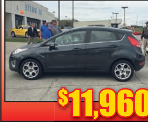
11 Ford Fiesta Sunroof, 40 MPG, Loaded, Stk#P4943