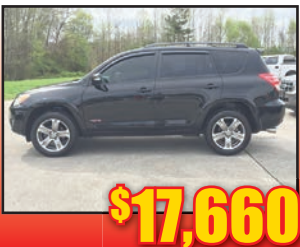
10 Toyota Rav4 4x4, Sunroof, Sporty Gas Saver, Stk#TF070B