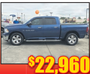
11 Dodge Ram Big Horn Crew Cab, 4x4, Must See, Stk#P4685A