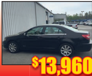
08 Lincoln MKZ Leather, Local Trade, Only 57K Miles, Stk#TE082D