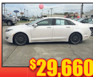
13 Lincoln MKZ Hybrid, Roof, Leather, Nav., 40 MPG, Stk#TF060A