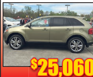
12 Ford Edge Limited, Nav, Roof, Chrome, Wheels, Stk#P4944