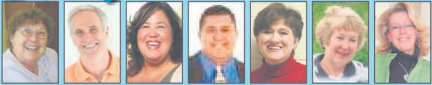
Co-worker Brother Best Friend Neighbor Church Member Club Friend Sister-in-Law