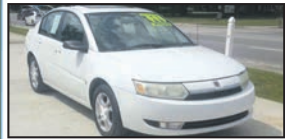
Stk.#3564R1 • $9,995 • $699 Down