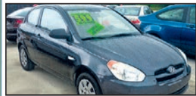
Stk.#4529R • $10,995 • $599 Down