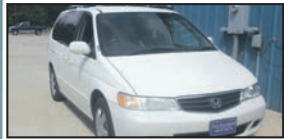
Stk.#CF1044R1 • $8,995 • $499 Down