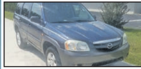
Stk.#5262 • $9,995 • $699 Down