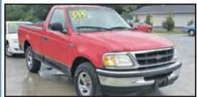
Stk.#5286 • $8,995 • $599 Down