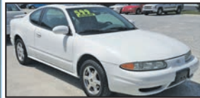
Stk.#4736R1 • $7,995 • $499 Down