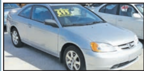
Stk.#5237 • $9,995 • $699 Down