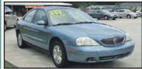
Stk.#4484ARA • $7,995 • $499 Down