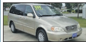
Stk.#3525R1 • $8,995 • $599 Down