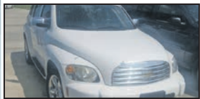
Stk.#4231R • $9,995 • $699 Down