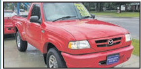
Stk.#5077A • $8,995 • $599 Down