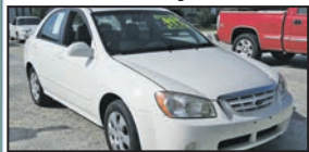
Stk.#5196 • $9,995 • $699 Down