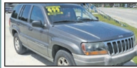
Stk.#CF2780R • $7,995 • $499 Down