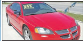
Stk.#3271R1 • $9,995 • $699 Down