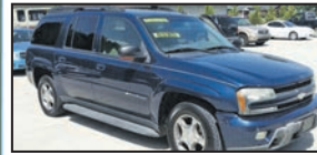
Stk.#R1001 • $7,995 • $399 Down