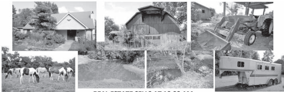
REAL ESTATE SELLS AT 10:00 AM

APPROX. 111 ACRE FARM IN 3 TRACTS WITH 3 BEDROOM HOME, BARN, CREEK, 2 PONDS, FARM EQUIPMENT, WOODWORKING TOOLS, FURNITURE, AND 9 HORSES.