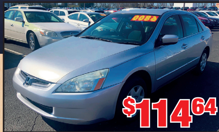
2006 Honda Accord EX Stk#SC271A Sale Price: $6,532 • 72 Mos