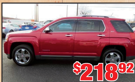
2013 GMC Terrain Stk#TT121A Sale Price: $12,800 • 72 Mos