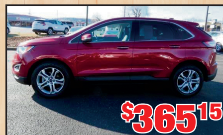
2017 Ford Edge Titanium Stk#SC261 Sale Price: $21,590 • 72 Mos