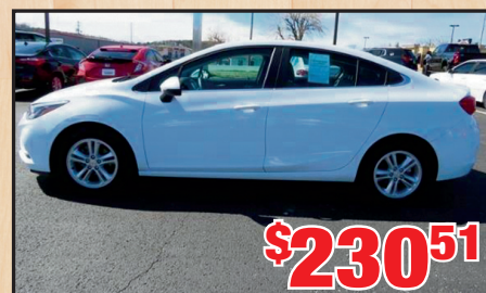
2017 Chevy Cruze LT Stk#SC284 Sale Price: $13,521 • 72 Mos