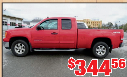
2011 GMC Sierra 4WD Stk#CT43A Sale Price: $20,352 • 72 Mos