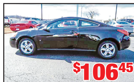
2008 Pontiac G6 Stk#CU06B Sale Price: $6,040 • 72 Mos