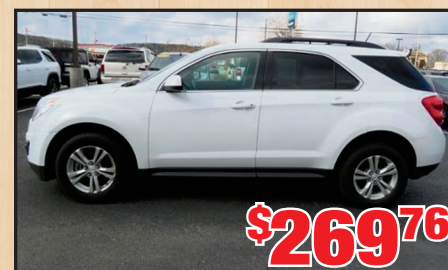
2015 Chevy Equinox Stk#PC5623 Sale Price: $15,856 • 72 Mos