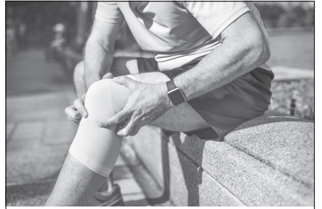
Study shows this treatment was successful in 75% of knee arthritis pain sufferers... saving them from surgery for at least 7.3 years. Will it work for you? Find out for FREE