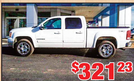
2009 GMC Sierra SLT 4WD Stk#PC5631 Sale Price: $18,950 • 72 Mos