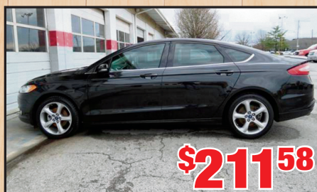
2014 Ford Fusion SE Stk#TT310C Sale Price: $12,359 • 72 Mos