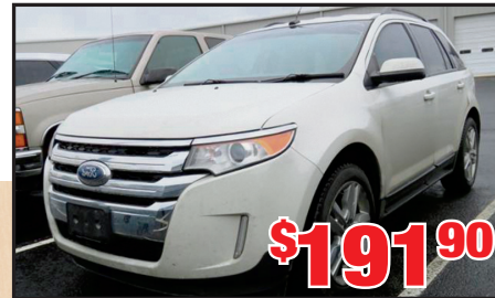
2012 Ford Edge SEL Stk#CT46A Sale Price: $11,176 • 72 Mos