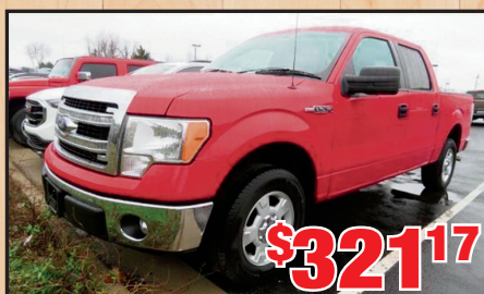
2013 Ford F-150 XLT Stk#TU67A Sale Price: $18,946 • 72 Mos