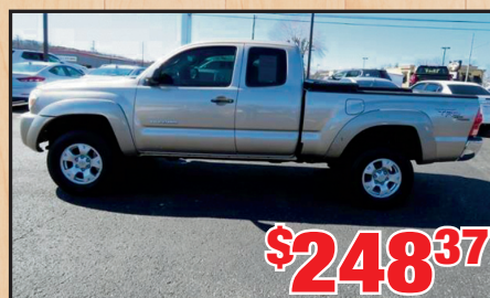
2007 Toyota Tacoma Stk#SC276A Sale Price: $14,567 • 72 Mos