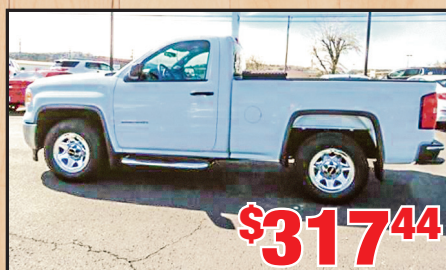
2014 GMC Sierra Stk#TT291A Sale Price: $18,722 • 72 Mos