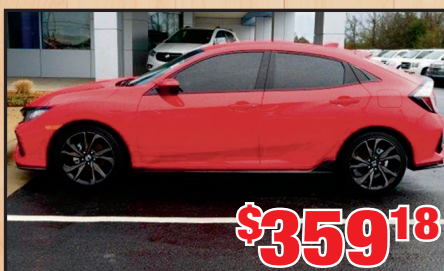
2018 Honda Civic Sport Stk#CT15A1 Sale Price: $21,231 • 72 Mos