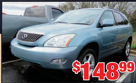
2004 Lexus RX 330 Stk#SC104D Sale Price: $8,597 • 72 Mos