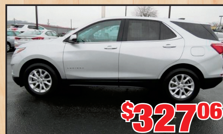
2018 Chevy Equinox Stk#TU57A Sale Price: $19,300 • 72 Mos