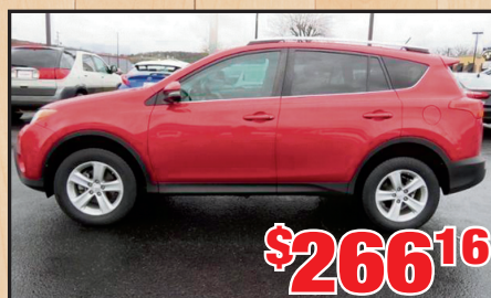
2013 Toyota Rav 4 Stk#CT22A Sale Price: $15,688 • 72 Mos