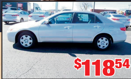
2005 Honda Accord LX Stk#PC5606D Sale Price: $6,788 • 72 Mos