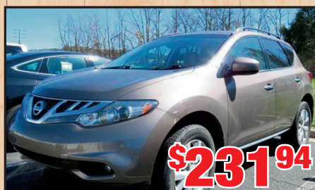
2014 Nissan Murano Stk#TU79A Sale Price: $13,583 • 72 Mos