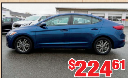
2018 Hyundai Elantra SE Stk#SC289 Sale Price: $13,142 • 72 Mos