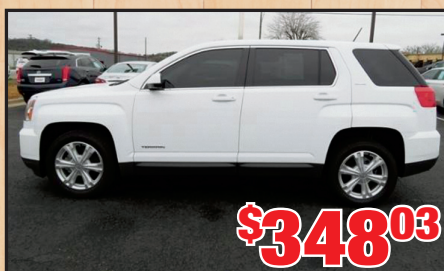
2017 GMC Terrain Stk#CT13A Sale Price: $20,561 • 72 Mos