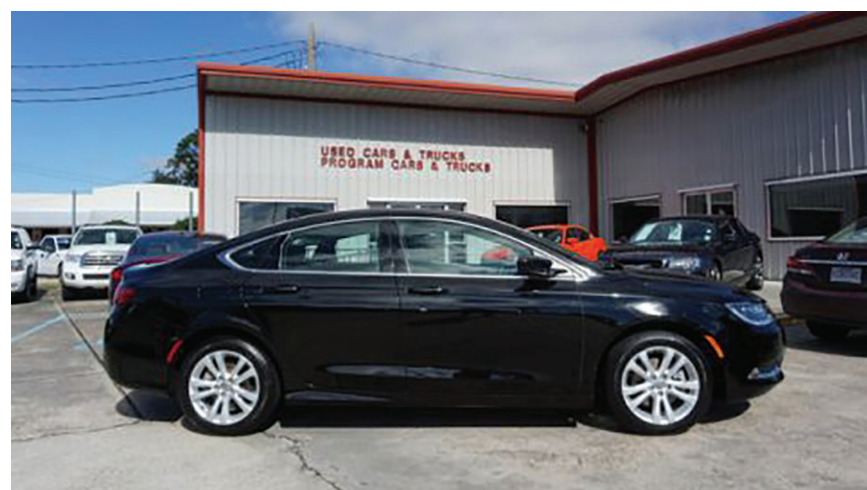
16 Chrysler 200 Limited #10891A..... $13,997