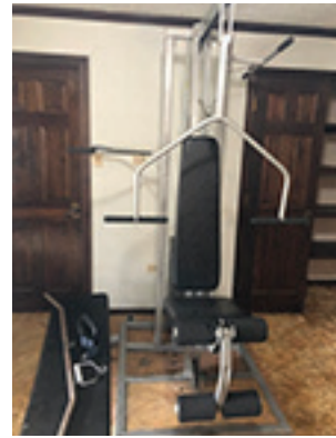
EXERCISE EQUIPMENT multi function, $200 (985) 855-7556