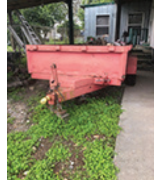
2008 DUMPING TRAILER 12.5 x 6.5, double axel, $3,500. 985-856-0621

1999 CHEVROLET S10 BLAZER 4.3, V-6, $1,200. 985-852-8866