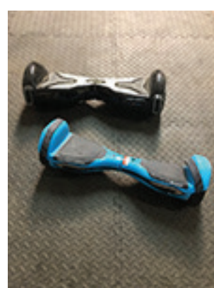
HOOVER BOARDS $150 for 2. (985) 855-7556

222 BRASS FOR 7MM WSM , one or two firings on some, zero on most, $150. 985-688-6014