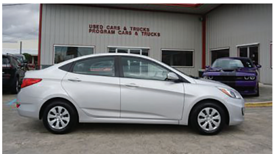
17 Hyundai Accent SE #11033..... $10,997