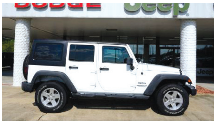
16 Jeep Wrangler Unlimited Sport #T8J029AA..... $23,997