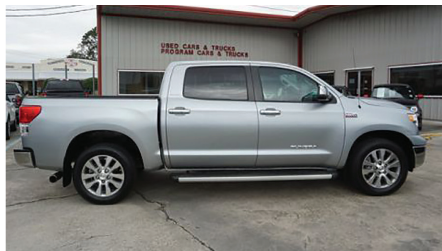
12 Toyota Tundra Limited #8T0043A ..... $21,997