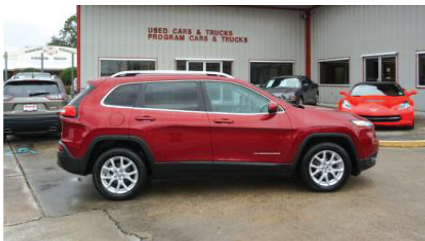
17 Jeep Cherokee Latitude #10920AA..... $18,997