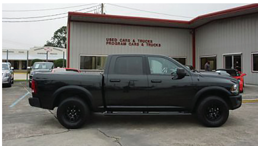
17 RAM 1500 Rebel #11089..... $37,997