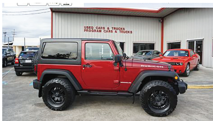
13 Jeep Wrangler Rubicon #10965B ..... $26,997