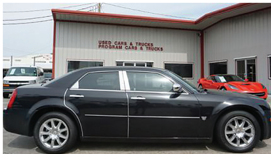
07 Chrysler 300C #9C0020A..... $9,997