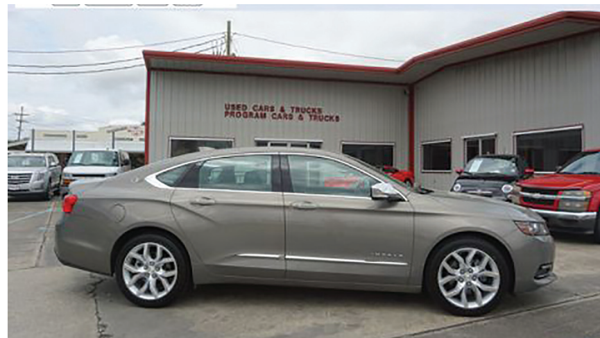
18 Chevrolet Impala Premier #11090..... $21,997