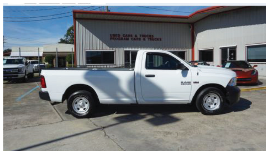
14 RAM 1500 Tradesman #9T0007B..... $14,997