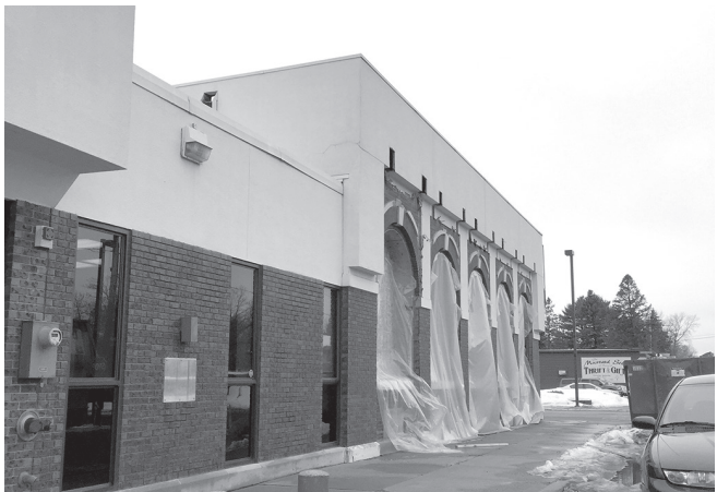
Deerwood Bank in Deerwood is undergoing its first extensive remodeling since 1974.