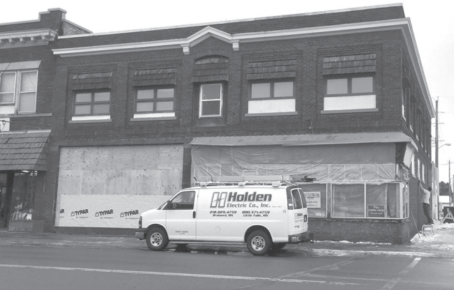
Formerly Crosby Super Valu — many decades ago — this building will be the home to Rafferty's Pizza on the ground floor and hotel rooms upstairs.