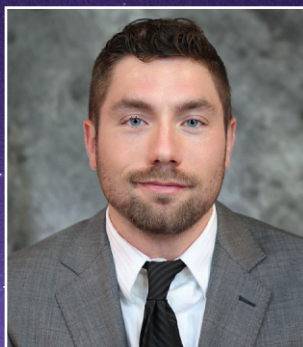
Christopher Allen Spirit Award (Chittenango)

We're pleased to announce these award winning agents who were recently recognized for their accomplishments. They represent the true spirit of Howard Hanna Real Estate Services. We thank them for their dedication to the real estate profession, customer service, and our community.