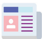
Local News Advertising

Adtaxi is a client-centric organization that brings scale, precision, and sophistication to digital marketing. Leveraging the belief that people matter as much as technology, we help automotive dealerships solve complex marketing challenges with custom, performance-driven solutions.