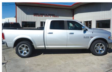
18 Ram 1500 Laramie #11000.....$37,997

222 BRASS FOR 7MM WSM, one or two firings on some, zero on most, $150. 985-868-6014