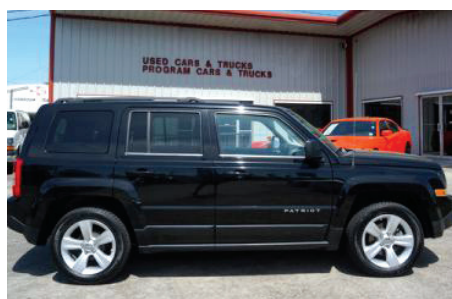
12 Jeep Patriot Latitude #9J0067B.....$9,997