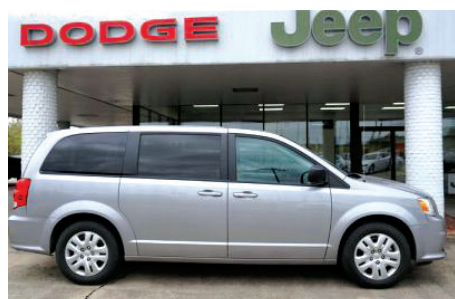
18 Dodge Grand Caravan SE #T0123.....$19,997