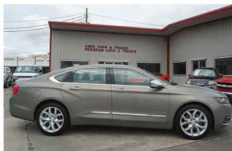
18 Chevrolet Impala Premier #11090.....$21,997