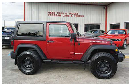
13 Jeep Wrangler Rubicon #10965B.....$26,997