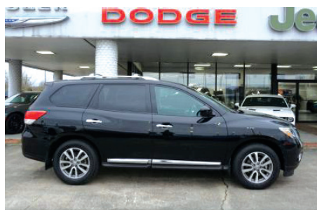
14 Nissan Pathfinder SL #T0189A.....$18,497