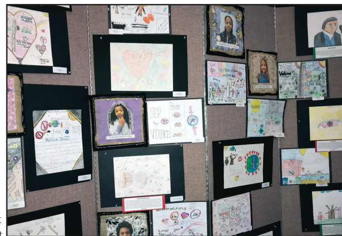
Artwork of the talented artists was on display during the gallery show.

For more information about Art Against Violence, visit their Facebook page under Art Against Violence.