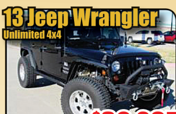
13 Jeep Wrangler Unlimited 4x4 STK# 3210Q $30,295