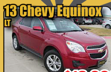
13 Chevy Equinox LT STK# 9162A $18,000