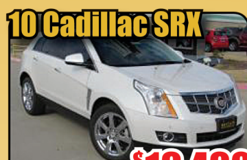
10 Cadillac SRX STK# 8756C $19,490