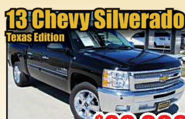
13 Chevy Silverado Texas Edition STK# 9032A $26,000