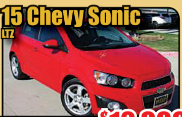
15 Chevy Sonic LTZ STK# 3203P $12,000