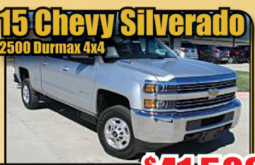
15 Chevy Silverado 2500 Duramax 4x4 STK# 3208P $41,500