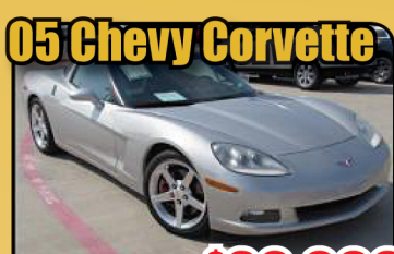
05 Chevy Corvette STK# 8995A $20,000