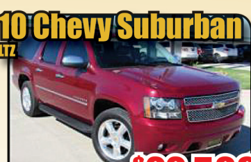
10 Chevy Suburban LTZ STK# 3208P $22,500