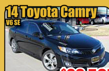
14 Toyota Camry V6 SE STK# 8545A $20,595