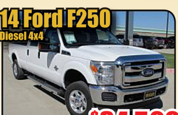
14 Ford F250 Diesel 4x4 STK# 8686B $34,500