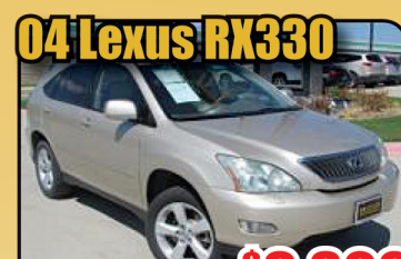
04 Lexus RX330 STK# 3165Q $9,800