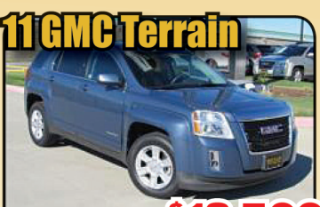
11 GMC Terrain STK# 9009A $13,500