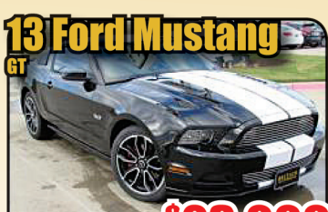
13 Ford Mustang GT STK# 8963A $23,000

BRITAIN CHEVROLET Cadillac BRITAINCHEVY.COM