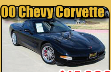
00 Chevy Corvette STK# 8747B $14,290