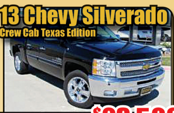
13 Chevy Silverado Crew Cab Texas Edition STK# 8485A $23,500