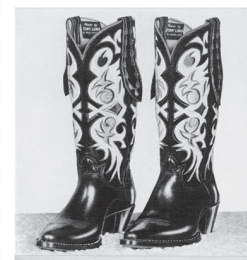
"El Presidente" Hand Made for The Honorable Harry S. Truman President Of The United States BY TONY LAMA COMPANY, INCORPORATED Presented Through The CHAMBER OF COMMERCE EL PASO, TEXAS "Every Pair A Masterpiece"

If we looked back to Texas territory in February 1836, we could not ignore the undercurrent of restlessness and fear among the colonists. Most had endured the fifteen-year rule of Mexico and by late 1835, they had driven out the Mexicans from their chosen land only to see them returning during the first weeks of the new year. Santa Anna was methodically gathering forces to put down the colonists' rebellion. The tension would come to a head in the most telling battle in Texas history, and it would be fought largely by brave volunteers from other states. By late Spring, this land of bluebonnets would come into its own as a nation, and a lot more change would come. Let's observe this season of the 180th anniversary by looking at something that is notably Texan.