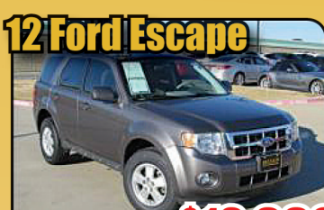
12 Ford Escape STK# 9004B $12,990