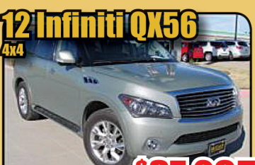
12 Infiniti QX56 4x4 STK# C4323A $37,295