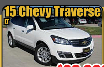
15 Chevy Traverse LT STK# 3219P $28,000