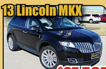
13 Lincoln MKX STK# 8803A $27,595