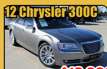
12 Chrysler 300C STK# C4319A $18,000