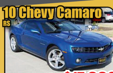
10 Chevy Camaro RS STK# 9153A $17,990