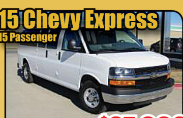
15 Chevy Express 15 Passenger STK# 3199P $27,000