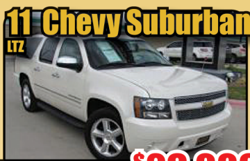
11 Chevy Suburban LTZ STK# 9089A $26,000