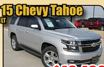
15 Chevy Tahoe LT STK# C4269A $48,490