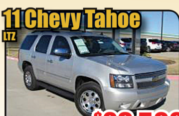
11 Chevy Tahoe LTZ STK# 8721A $29,500