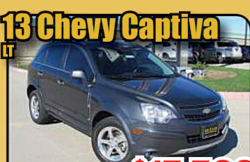
13 Chevy Captiva LT STK# 8607B $15,500