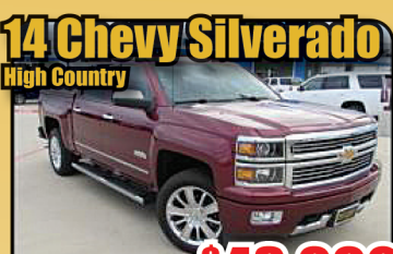
14 Chevy Silverado High Country STK#C4316A $43,990