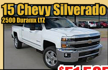
15 Chevy Silverado 2500 Duramax LTZ STK# 9051A $51,595