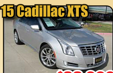
15 Cadillac XTS STK# 8963A $33,000