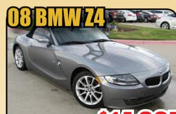
08 BMW Z4 STK# C4299C $14,895