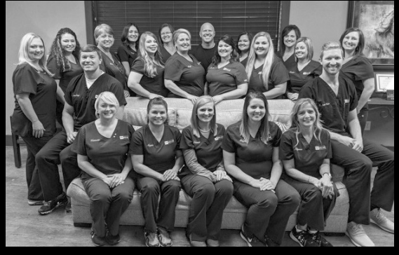
The entire staff of Total Dental Care says "Thank you!"