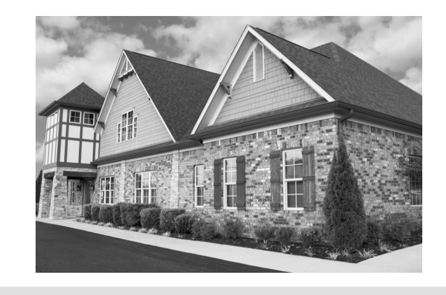
TOTAL DENTAL CARE